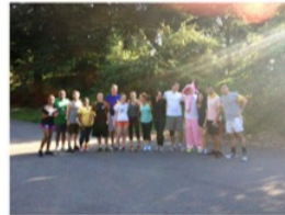
NEW YORK CITY, USA