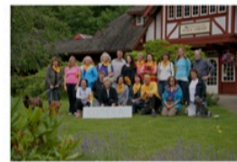
BOWEN ISLAND, CANADA

WE HOPE YOU'LL RUN WITH US IN SOLIDARITY AGAIN IN 2014!