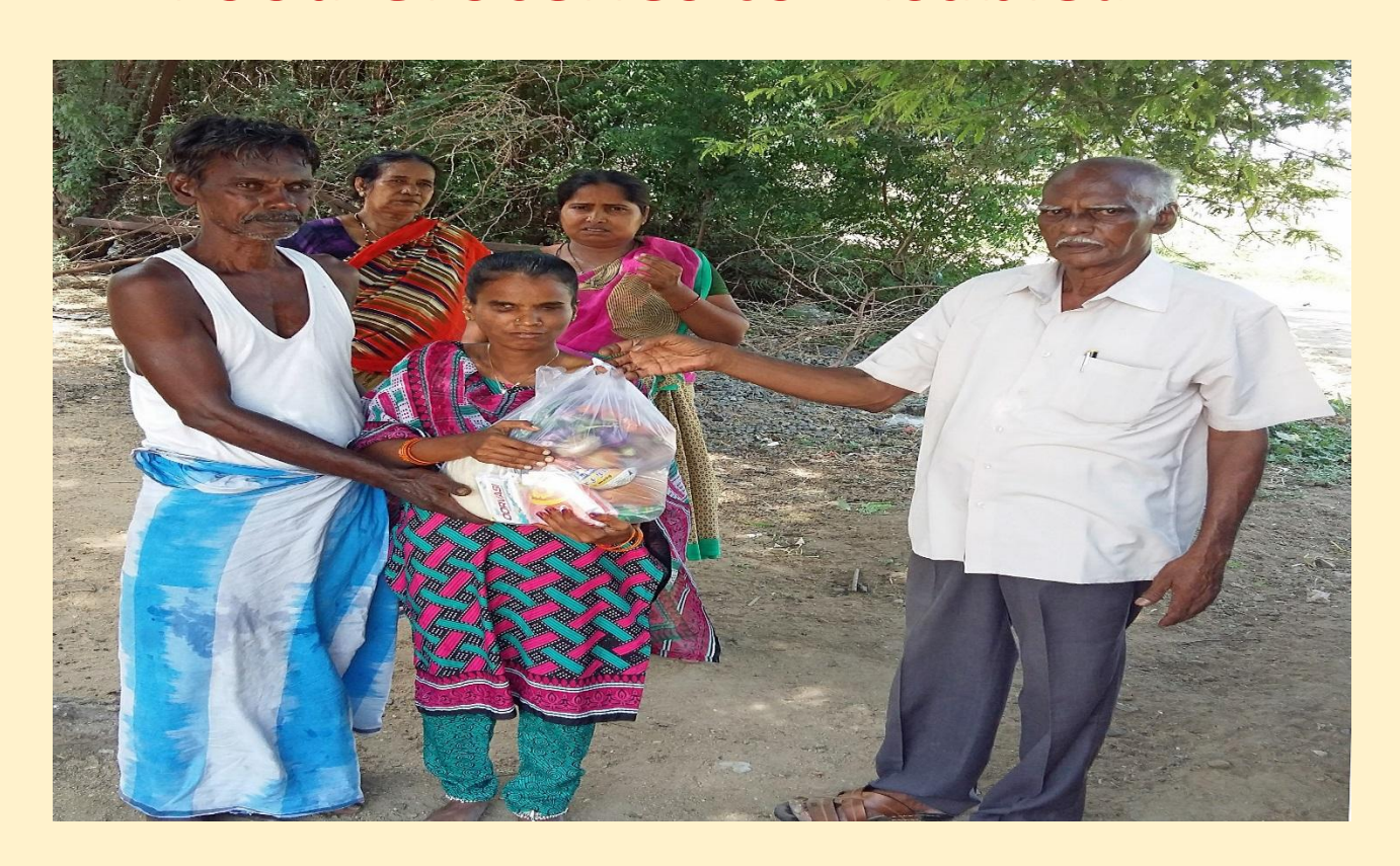
Food Groceries to Blind Girl