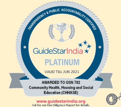
Guidestar India Platinum Seal of Transparency

The less privileged elderly need our love and care, our little contribution to make their world healthier and