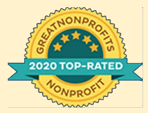
Great Nonprofit Badge