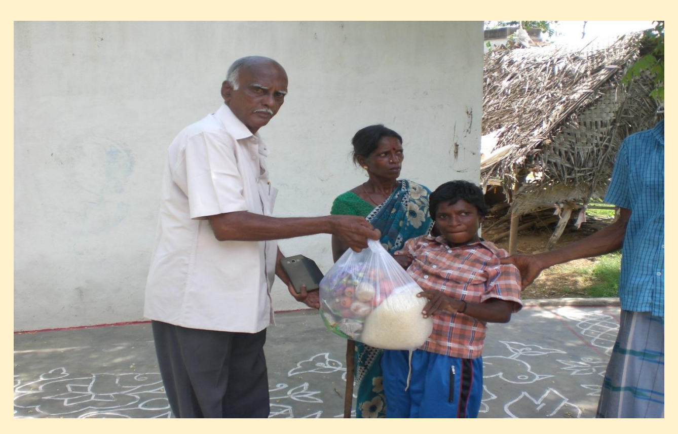
Food Groceries to Polio affected Girl