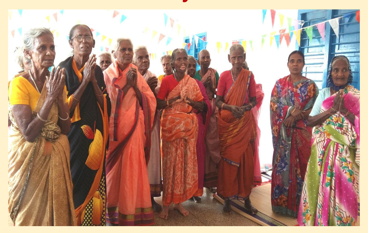
Elders are happy