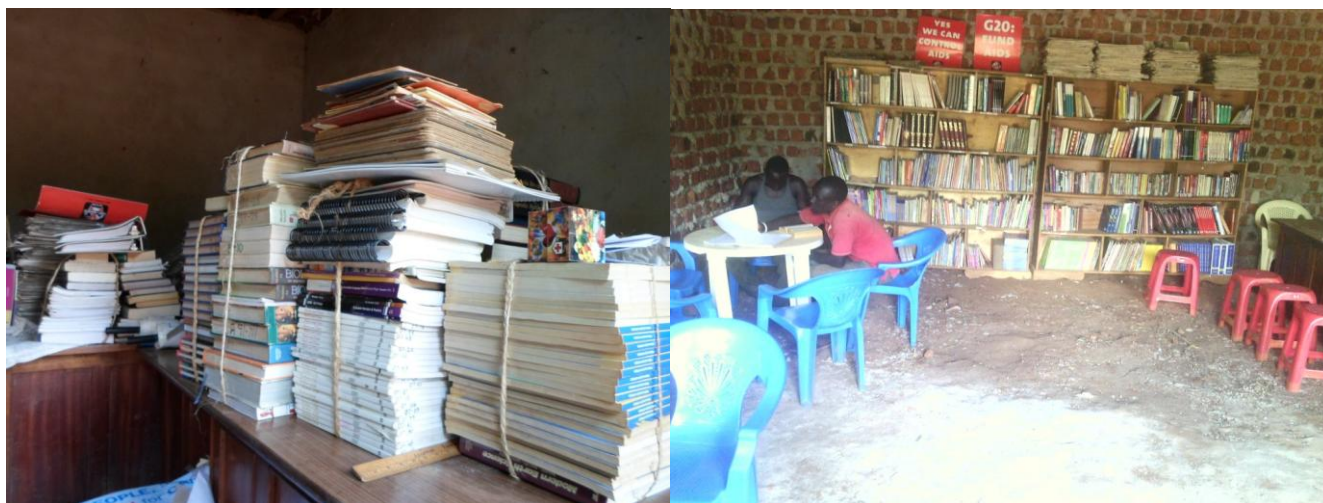
Books parked for transfer while other library users do their personal reading at the New Resource Center.

Dear development collaborates, Happy 2015! The New Year brings and renews our commitment to community service in previously underserved communities. AHF grant Award to roof and buy shutters made us unstoppable and nothing would hold us back to move to the centre. Just as the first day, this is one of the many highlights' of another rewarding year for CFYDDI.