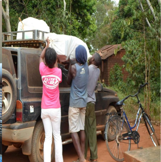
The Team busy with different tasks to move the office!

Be Healthy, Be knowledgeable, Be active, Be You