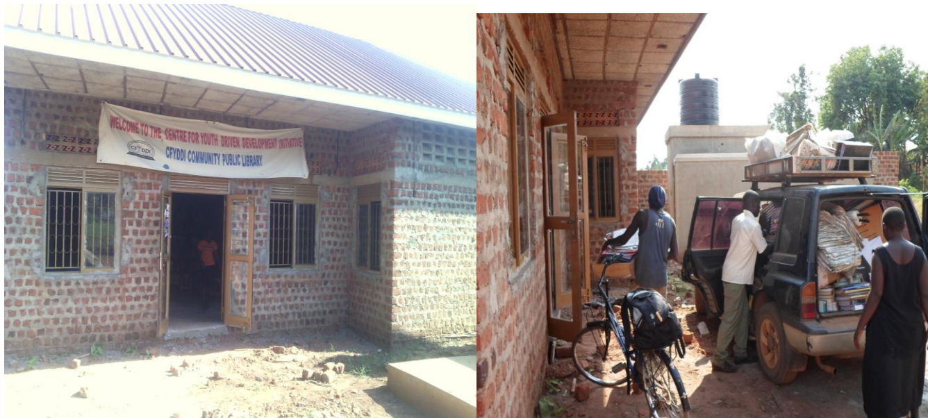
CFYDDI Center at its current state and at the right hand Corner books being offloaded from the car.

AIDS Healthcare Foundation (AHF) brings an enthusiasm big push for fresh starts and endless possibilities with a grant for roofing and shutters making the dream to occupy arrive as a surprise faster than we expected!