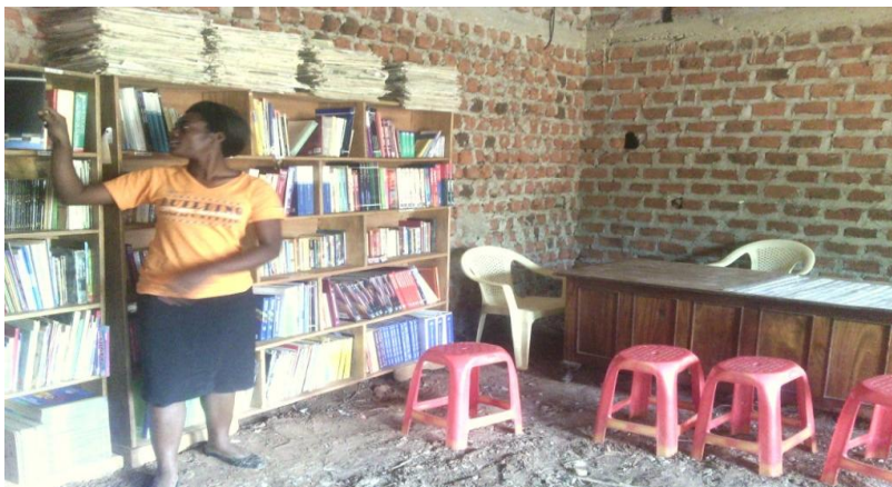
Inside the New resource room. Joanith arranges books

Joanith Nabayunqa is now undergoing mentorship and training for a new role at the centre as we expand. So you can start to feel the weight of our contribution to building a nation of skilled Ugandans with an opportunity to integrate knowledge learned in the classroom with supervised practice in the field. We cannot underestimate our contribution to prepare young people for employment.