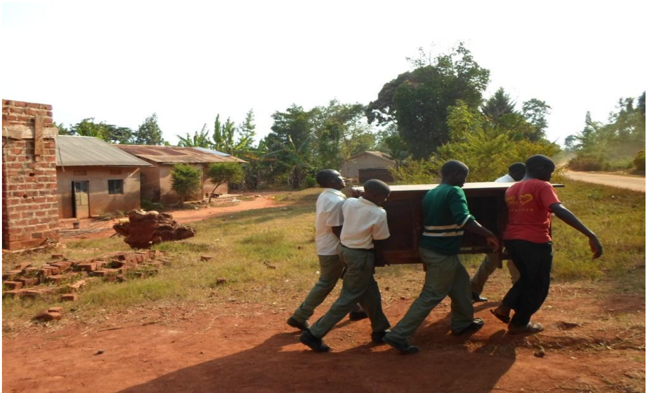
Together we can make it!

At CFYDDI, we have received your support, courage and celebrate the successes each day. We've very much appreciated the opportunity to engage with you, sharing our stories, and spark dialogue. We hope we've been able to contribute in some small way to your success as well. You may ask how we could be in position to do that. But wait a minute, every time a person gives for a noble cause and being able to see physically what has been achieved, you receive an extraordinary power of fulfillment being a part of a chain of people who have added value and impacted lives of thousands of struggling communities enjoy services that would not have been there in the first place and these are the small ways here at CFYDDI we hope that we have contributed to your success.