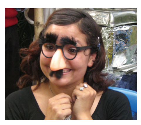
Look what I got for my birthday!

Magically, at the last minute, I found a magician who did all the usual things. The kids had fun climbing the trees in the garden and coming down with handfuls of mulberries. Each child had a cupcake with a candle, and everyone sang "Happy Birthday" as the child blew the candle out. I had brought small gifts from the US, after a few trips to the Dollar Stores. There was a good lunch, ice cream cones for dessert, and all went home happy and tired. We'll do it again next year. 💸