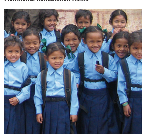
A few of the thousands of kids on NYOF scholarships in their new school uniforms