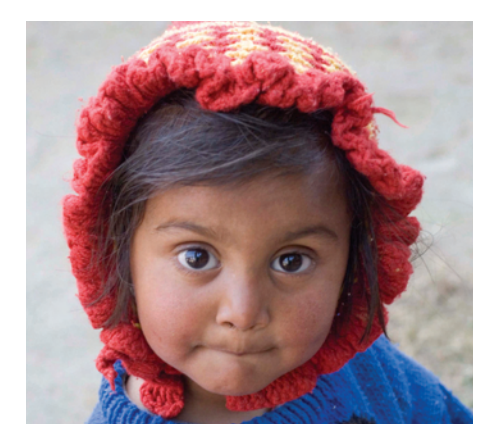
Cutie pie restored to health at NYOF's Nutritional Rehabilition Home