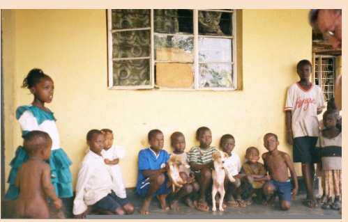
Uganda SPCA's community animal welfare program. Teaching children about kindness to animals.