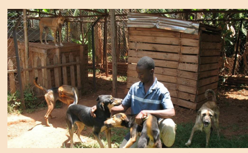
Uganda SPCA caretaker plays with Haven dogs

Back in the 1990s, at our spay/neuter field days in poor communities, we could get over 50 children gathered around to watch the surgery, and some had never met a vet before or knew that anyone could or would perform surgery on dogs and cats. Now, there are many Ugandan children who know about kindness to animals....and many who also proudly proclaim that they want to become veterinarians.