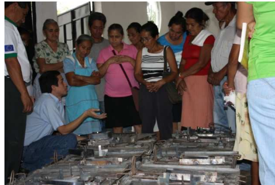
Talk on the use of the kitchens