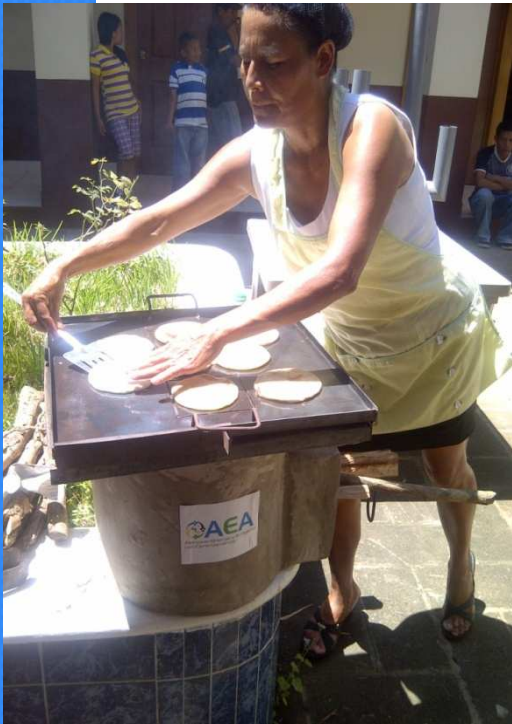
BENEFITED IN TACUBA