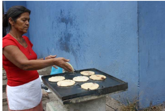
Utilization by the beneficiaries.