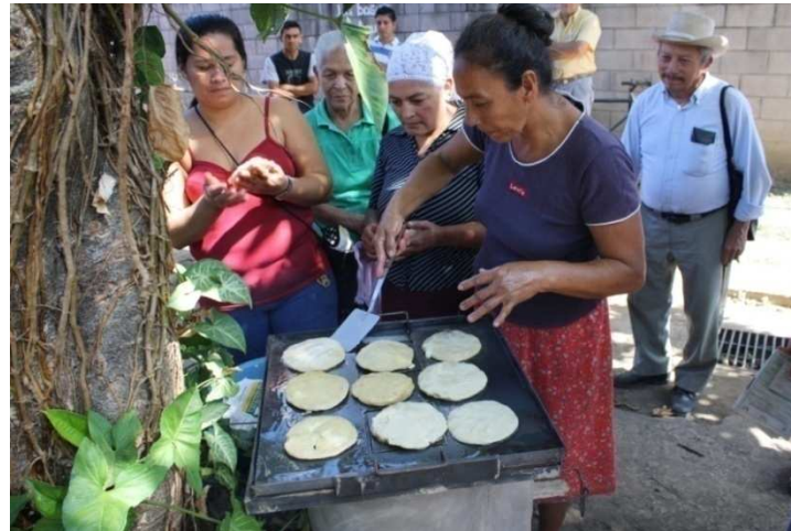
LADIES USING KITCHEN(CANTÓ N LOS SITIOS TALNIQUE)