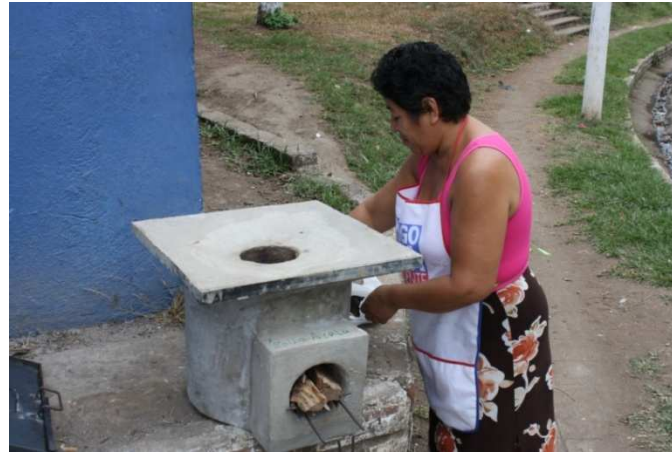
LADY PUTTING WOOD IN KITCHEN( VILLA SUCHIL, SACACOYO)