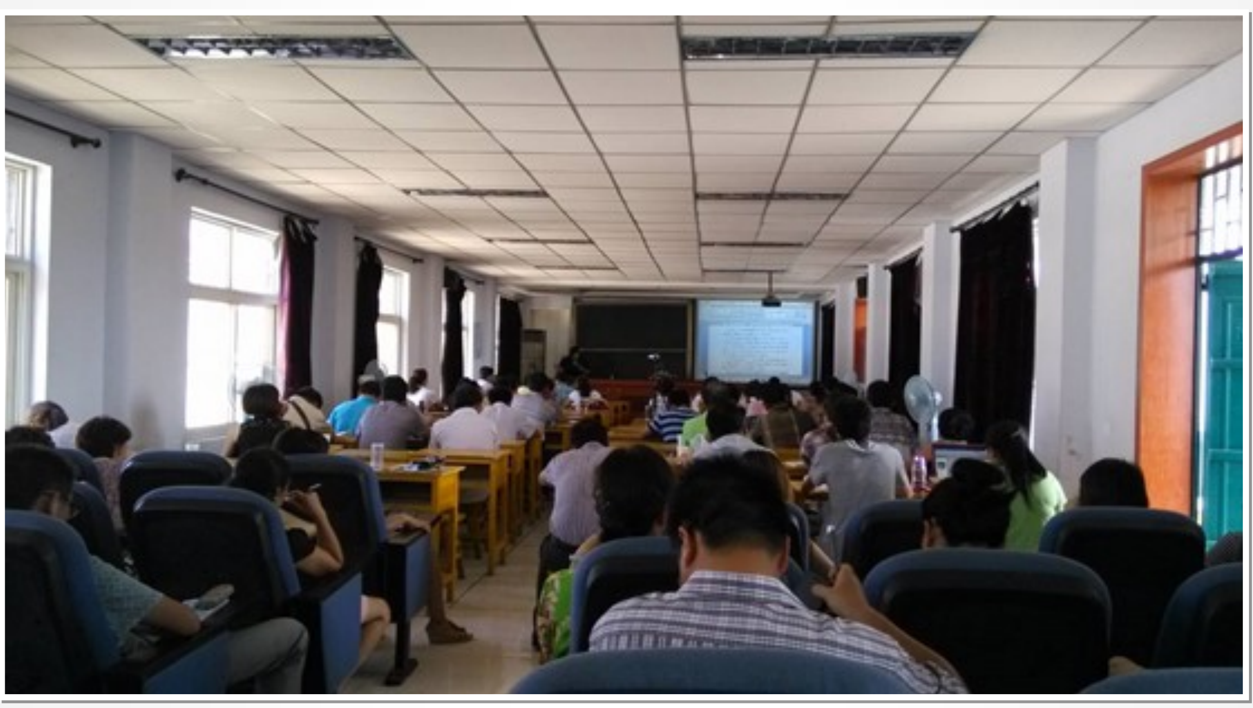
图: 2013年OCEF在河南栾川谭头中心小学首次成功举办了教师培训营,全国各地20 多所OCEF 种子学校和河南当地的共二百多位老师参加此次培训。

Above: In 2013 OCEF for the first time successfully ran the teacher training summer camp at Tan Tou Central Elementary School in Luan Chuan, Henan Province. Educators from over 20 OCEF seed schools all over the nation, in addition to local teachers, altogether nearly 200, participated in the camp.