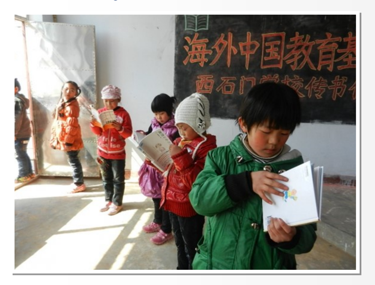
Above: OCEF Funded Library in Xishimeng Elementary School

It has come to OCEF's attention that books are not enough without an inspiring teacher who is able to cultivate students' enthusiasm in reading. Therefore, the library program has been focusing on motivating teachers, as well as providing them with tools to instill into their students the love for reading.