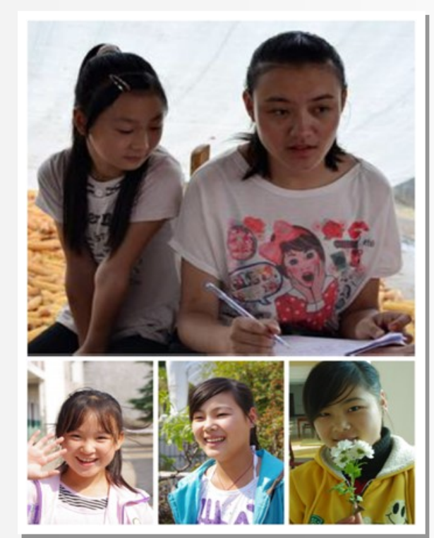
图: 四川巴中茶坝中学受助女学生 Left: Female Students in Chaba Middle