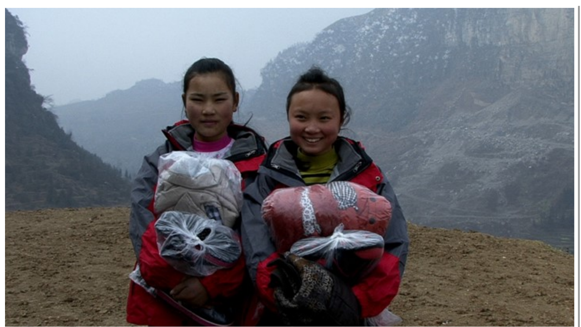
图: OCEF为贵州省织金县明华小学捐赠了 冬衣,这个冬天不再冷。

In 2013, OCEF worked with 34 schools from 8 provinces and regions by donating desks, chairs, school supplies and physical education equipment; renovating school buildings and dining facilities; hardening the playground; improving quality of student lunches; establishing multimedia online classes; and digging wells.