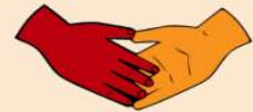
JOB PLACEMENT ASSISTANCE