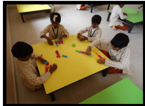
Activity & Play in Kinder Garten