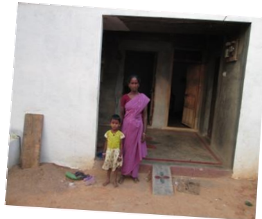
Mother and her child at home