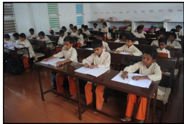
Learning by interest – Our classroom