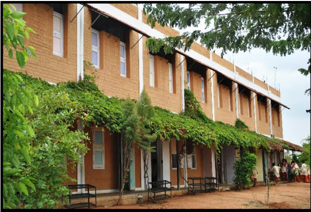
Isha Vidhya, Perumapalayam