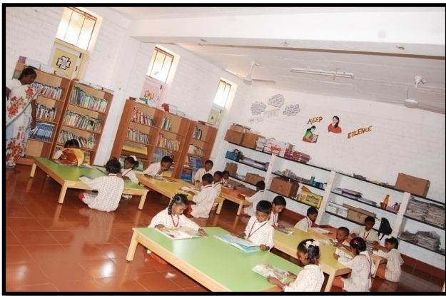
Silence please – Library