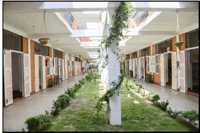
Clean Corridors – Ground Floor