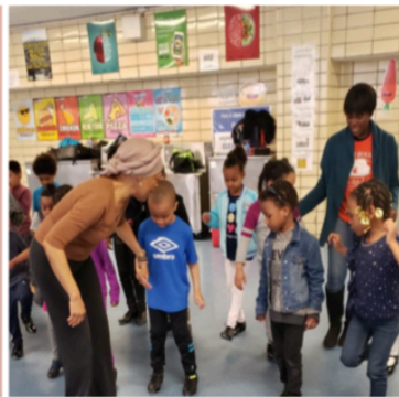
Sapphire Teaches Tap To Our Kindergarteners