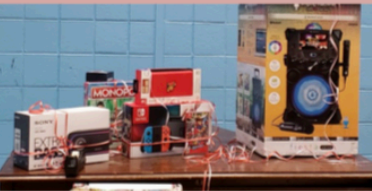
Parent Committee Raffle Draw May 31st Success