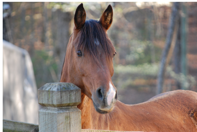
Above: Before and After photos of Bandit, rescued from starvation in July 2010.