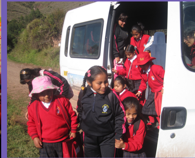
CW school van is tired but without it... no class that day