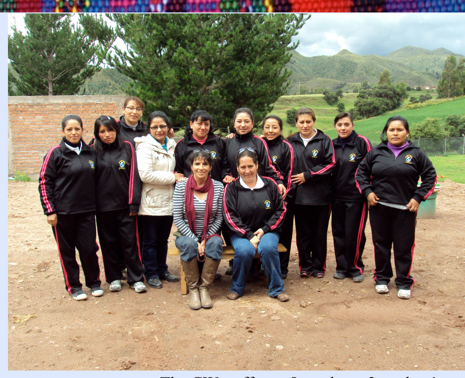
The CW staff; our 8 teachers, 2 cooks, 1 secretary and Administration.

Chicuchas Wasi School for Girls provides quality primary education and promotes gender equality, self-esteem, and human dignity for the marginalized indigenous girls of rural Cusco, Peru. With the CW education and skills the girls are empowered to become economically independent. They become important role models and leaders for the next generation of CW students. Our parent classes focus on helping the students family to understand the value of educating their daughters. The importance of family support is emphasized and families learn more effective communication skills that help to deter domestic violence against women and girls.