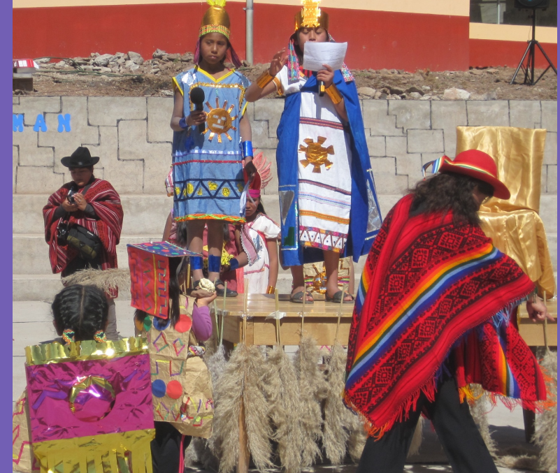
CW students learn history by creating a theatrical presentation to honor the Inca History during Inti Raymi. Students made all costumes, researched the history and created the play.