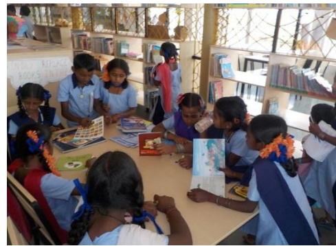
Book Reading -Sharing