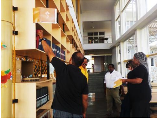
Visitors from USA