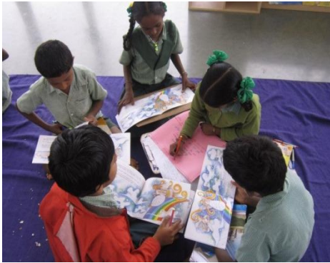
Pyramid story writing