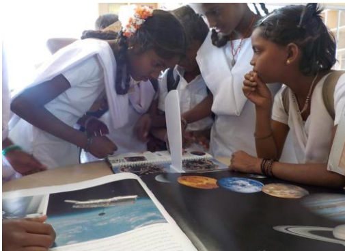
3D Books observation