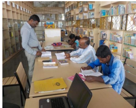
Gov Teachers utilizing Library Books