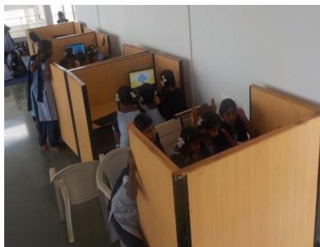
Digital Library utilization