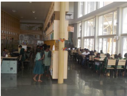
Govt.Children utilising library books