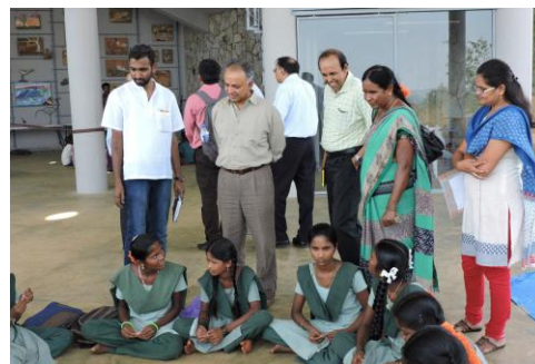
Day Special Event Kalakootami