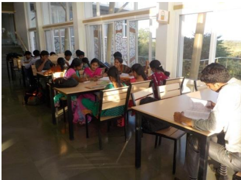
Our Staff utilization on every Friday