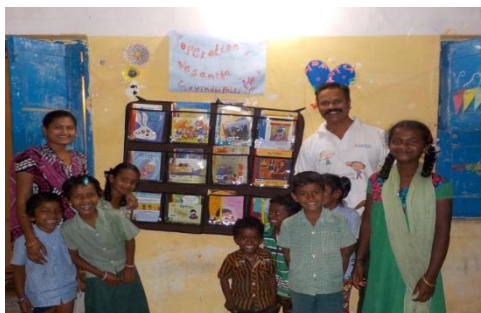
Books circulation to O.V.Center