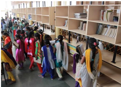
National Science Day