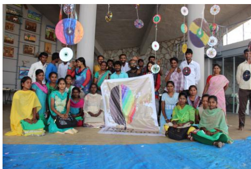
Day Special Event Kalakootami