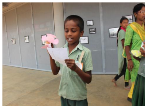
Roll play with Mouth puppet.