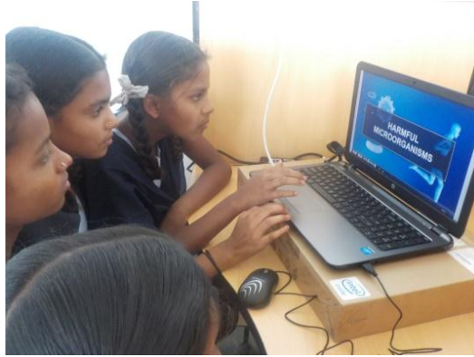
High school children utilising Digital Library