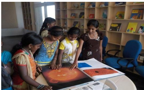
Kids curious to touch and feel the Univers book