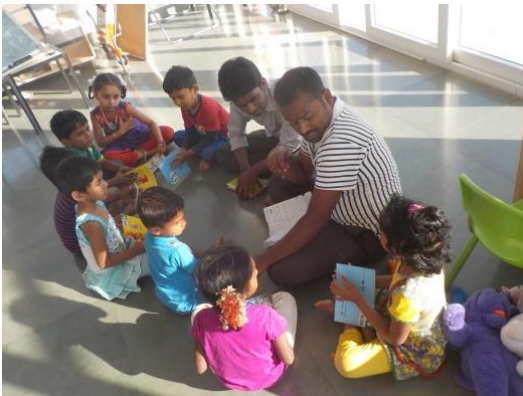
Early Learning Children