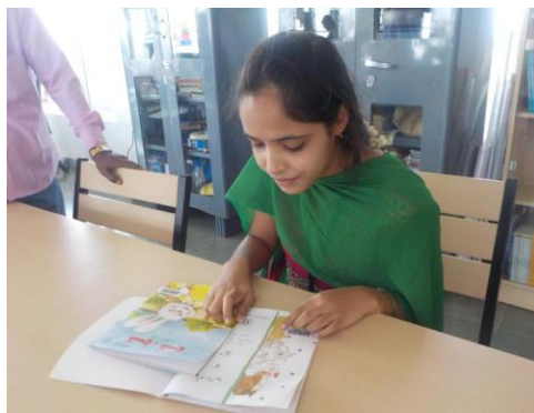
Urdu picture story books reading