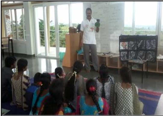
Training for O.V Volunteers