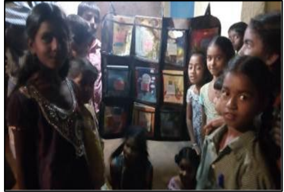
Dasamani palli Community Library.