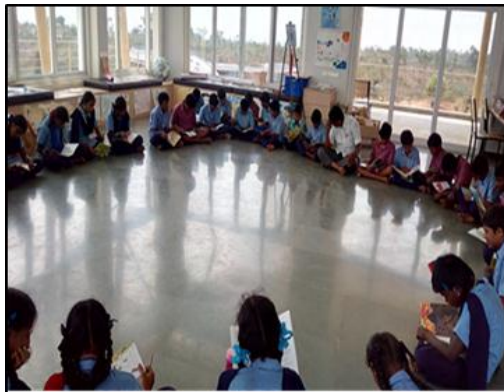
Book club activity in Library