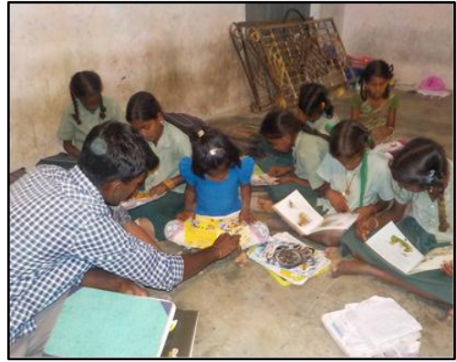
Inculcating reading habit at Community Library