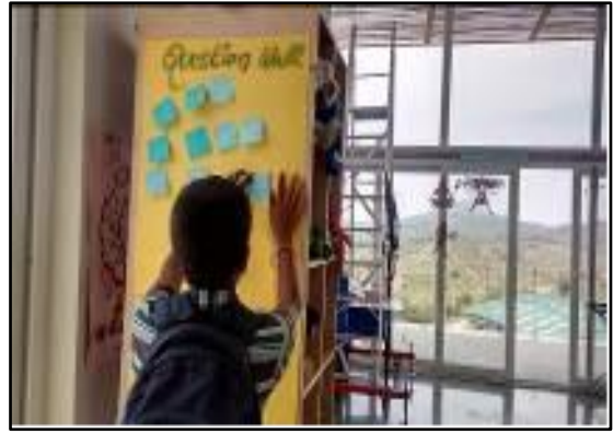
Encouraging kids to ask questions