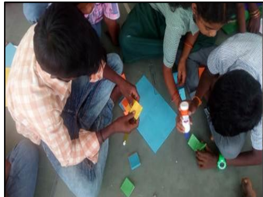
Mini book Making