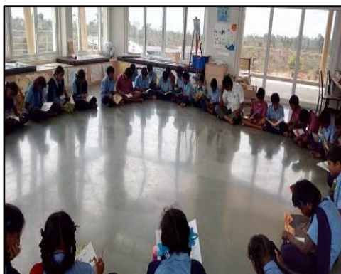
Govt.Children utilising library