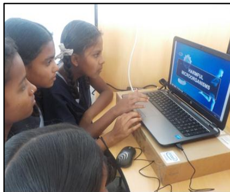
Digital Library content utilizing