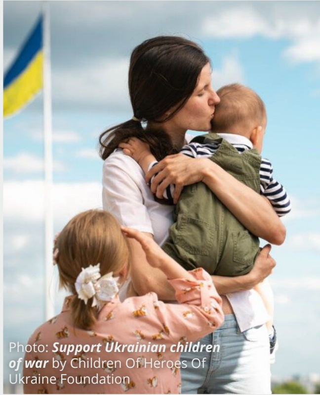
Photo: Support Ukrainian children of war by Children Of Heroes Of Ukraine Foundation

Here is a look at the impact your donations made in crisis-affected communities in 2023.