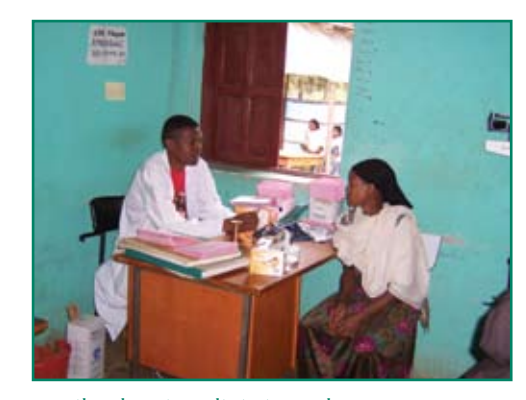
Family planning clinic in Areka, SNNPR

Through close collaborative relationships with partners and the Health Bureaus at all levels, Pathfinder works to improve their capacity until they can operate effectively and independently. Basic training and refresher training of CBRH Agents is ongoing. Supervisors and health facility service providers learn to enhance the quality of care delivered and to involve clients in the identification and evaluation of the services offered.