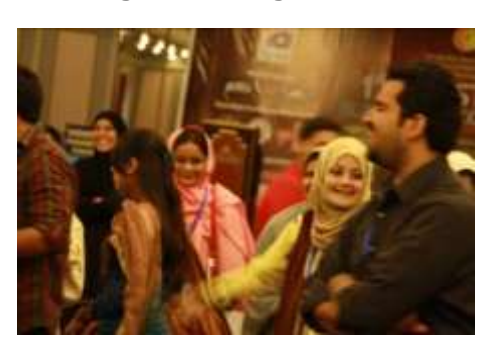
Finding the Group Partner