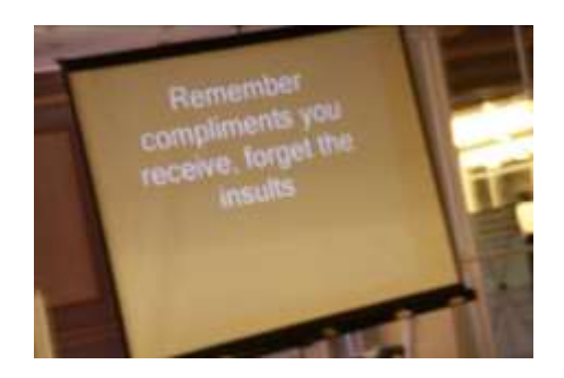
Session Presentation Slide