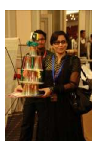
Result of Group Activities Result of Group Activities