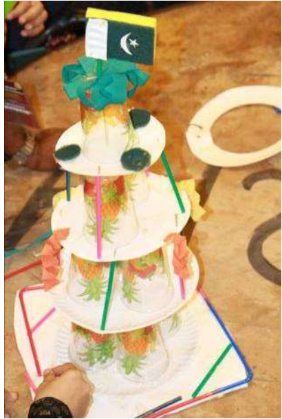
Result of Group Activities