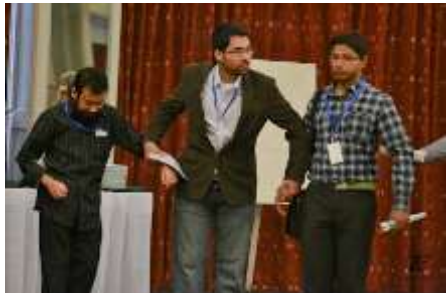
Visually Impaired and Sighted Participants together at Acitivies