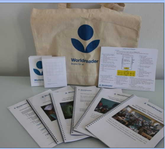
How do I become a Worldreader Kits partner?

We would love to hear from you. Please fill out our application form here: <a href="https://www.bit.ly/WRkitsapp">www.bit.ly/WRkitsapp</a>