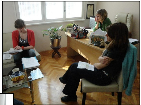
Above: National judges read aloud the final selection of winning essays.