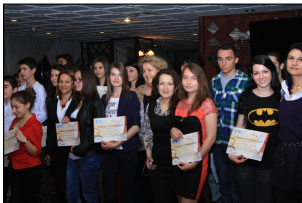
This year's national winners and their teachers pose with their awards in Sofia.