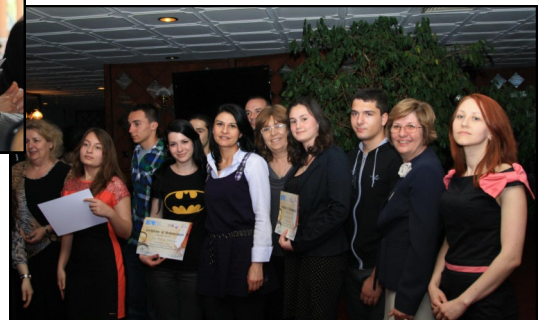
Right: Winners and their teachers join together for a group photo.