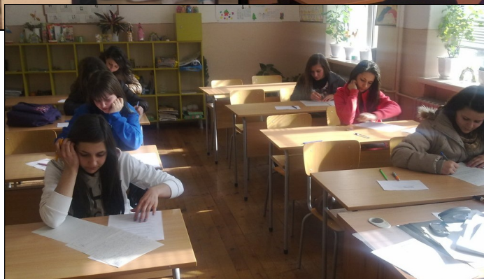
Above: SOU Otets Paisii, Smolyan Right: SOU Sava Dobroplodni, Shumen Below: SUCHEM Ivan Vazov, Sofia