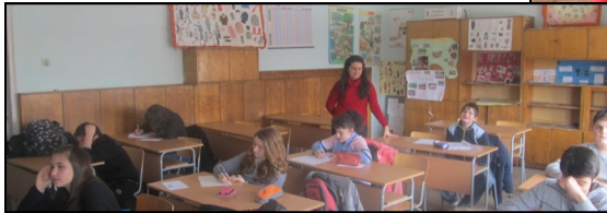
Above: PG Maria Luiza, Sofia Right: PG Hristo Botev, Botevgrad Left: OU Ivan Vazov, Silistra