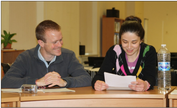
Above: Sofia judges enjoy an entertaining passage from an essay.