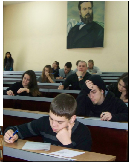
Above: SOU Hristo Botev, Vratsa