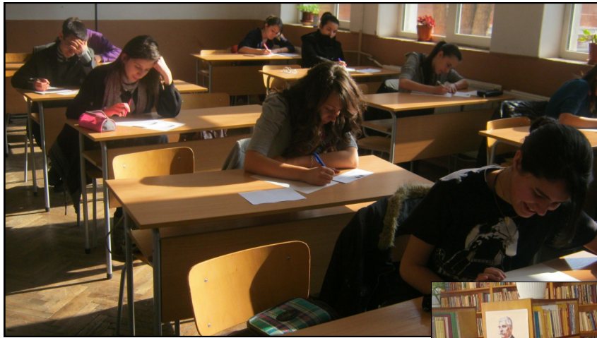
Above: SOU Vasil Levski, Sevlievo Right: SOU Kliment Ohridski, Plovdiv Below: SOU Kiril i Metodii, Yakoruda