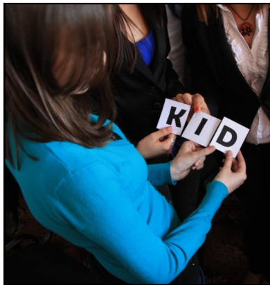
Above and right: Students and teachers break the ice at the workshops.