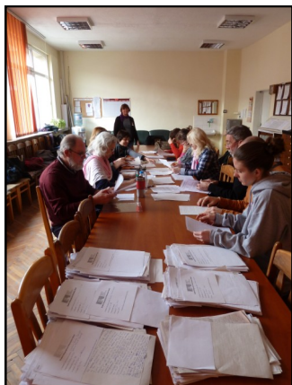
Regional judges worked hard to read nearly 1000 essays in Silistra.