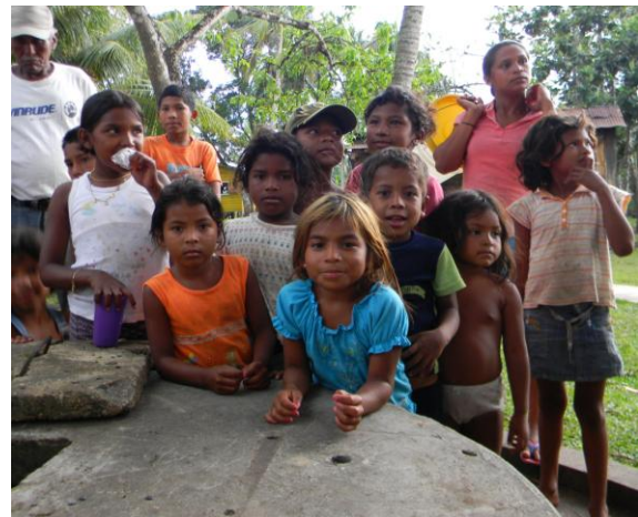
Children in Kisalaya gather around a well built in partnership with MADRE.