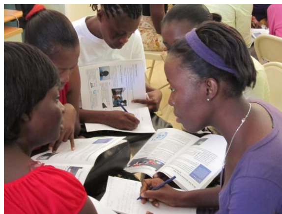
Haitian grassroots women take part in a training to learn about their human rights.

This was a defining moment in an intensive advocacy campaign, launched after the earthquake with our Haitian grassroots partners and with a coalition of allied organizations. But our work did not end with