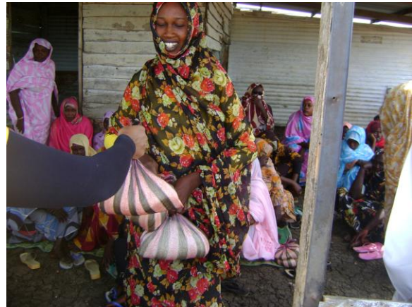
A young woman farmer receives seeds for the next planting season.

their harvest, and through MADRE, sent these proceeds to support the famine relief efforts of our partners in Kenya.