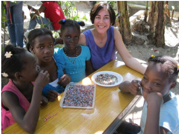
A workshop for young earthquake survivors at the KOFAVIV Center in Port-au-Prince.

Center is thriving. Women recovering from sexual violence now have a safe haven where they receive care, counseling, referrals for legal and medical services, short-term shelter, instruction in income-generating activities and human rights training.