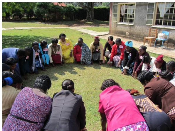
A MADRE human rights trainings for Indigenous Maasai women.

Thanks to your support, Womankind Kenya distributed food aid to four local villages in the hard-hit region of Garissa in northeastern Kenya: Kamoor, Noor, Diiso and Jarirood.