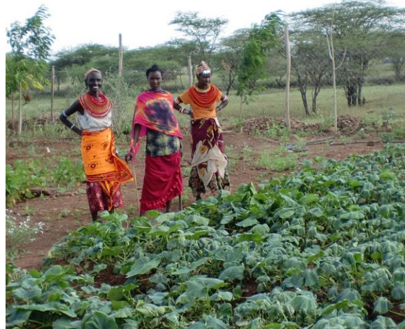
Indigenous women in Kenya with their crops, in a community supported by MADRE.