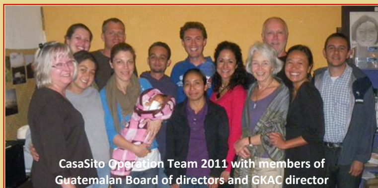
CasaSito Operation Team 2011 with members of Guatemalan Board of directors and GKAC director