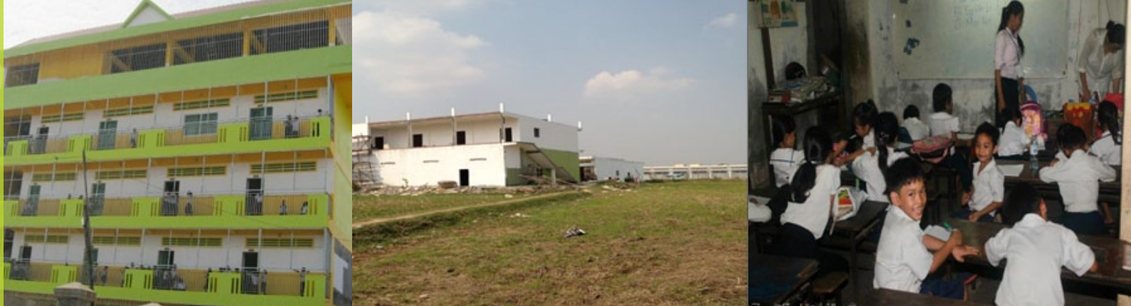
Stung Meanchey School