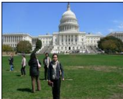
P'Noom visits The White House in DC.

Launched in 1940, the IVLP was designed to foster relations between the United States and other nations through professional visits to the U.S. for current and emerging foreign leaders.