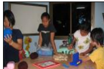
Children get creative in the Activity Room

An excellent place for the children to practice their English and get help with their homework, children can also make crafts, play the guitar, listen to music, read books, play games, or simply hang out after a busy day at school.