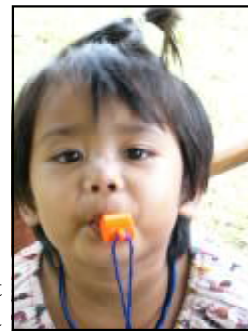
Whistles as gifts

My time at BCPR has been spent organizing activities for the children. In my last ten weeks at BCPR, the children worked on an exhibition that was held on July 9. Children and staff from DEPDC in Mae Sai came to look at art work, watch a drama and music show, and joined in workshops.