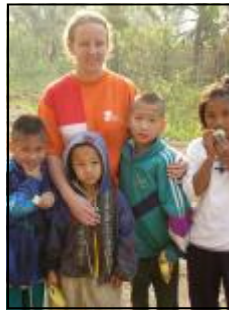
Helma and children

I have been working at the Border Child Protection and Rights (BCPR) centre, located near Mae Chan, since February 2005. The site opened in January, with a stone building serving as the office and the girls' dormitory, a bamboo house for the boys, and a tent school.