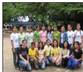
Maggie with MYN-2 students

These students will follow much of the same curriculum as the original group of 12 girls. Throughout the year participants had leadership training, including conducting research, writing reports, and building teams from a human trafficking prevention angle. The training also included two village home stays, many field visits locally and in places such as Chiang Mai and Bangkok, and finally a six-week internship related to human rights.