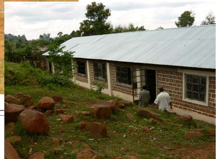
New science lab and classrooms at Boruma Secondary