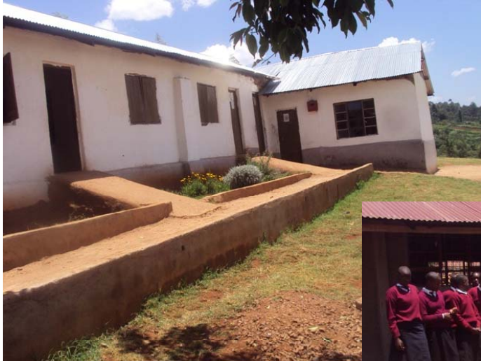
A new roof at Primary Boruma

Schools projects, such as the ones below, target infrastructure needs that when met, enhance the quality of the student's health and education.