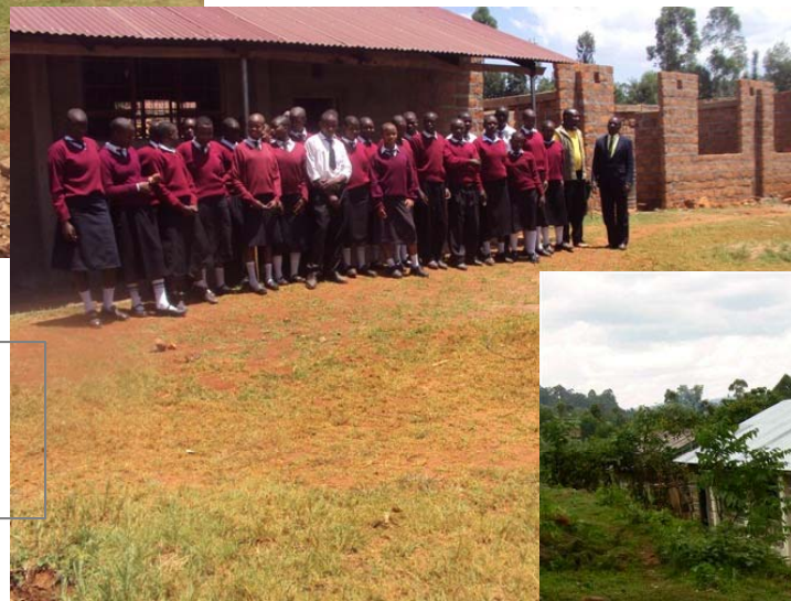
New classroom at Nyankororo Secondary