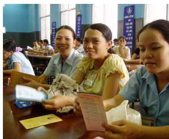
Chi Hung Footwear Factory

Total Market Approach applied through Public Private Partnerships in SRH services to ensure that clients benefit from efficiency, effectiveness, and equity in the provision of SRH services.