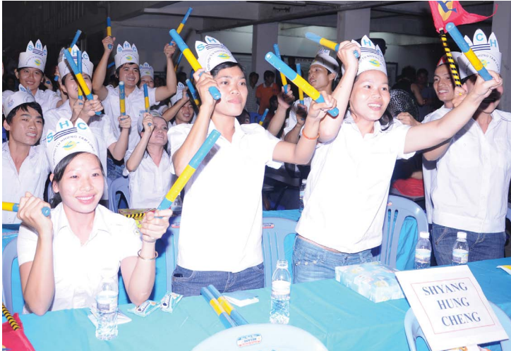
'Choose Your Bright Future' knowledge contest - Pou Yuen Factory, Ho Chi Minh City