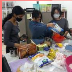
Bake Sale by British School Jakarta students