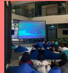
Movie Night by Club Rachel House of Jakarta Intercultural School

As school activities return, we are delighted to receive the support once again from students of British School Jakarta and Jakarta Intercultural School . We also get to welcome a new partnership with Bina Bangsa Preschool who selected Rachel House as the beneficiary for their Christmas charity program.