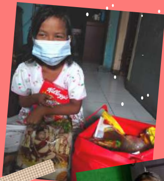
Groceries, diapers, and milk

As with tradition, gift of new clothes and special food items on Idul Fitri, special toys on Christmas and birthday cakes to bring smiles to the children. Essential items of food, diapers, milk, bring relief and happiness to their parents.