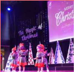
Bina Bangsa Preschool the Magic of Christmas Event

It is important for us that they are included to help give voice to the plight of the children of Rachel House. This year, we are blessed to have the committed spirits of the students from these wonderful schools.