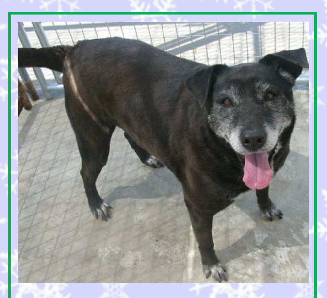
Las Lomas K9 Rescue PO Box 494 Floresville TX 78114 www.dogsrus.org

Foundation believes these dogs are truly an important part of us and we take their lives and well-being very seriously. We search for loving, safe, and caring homes where the dogs remain as family. When you adopt a dog from us, you become part of the family. We gladly take back any dog that we have adopted out that isn't working out in his or her new home, for any reason, for life. In fact, we require the animals be returned to us if they don't work out in their new home. This way, the adoptive parents don't have to worry about what to do and we know the dog is safe back with us.