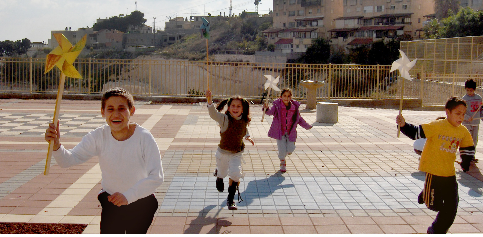
Support Masar First Alternative Palestinian School by Masar Institute for Education