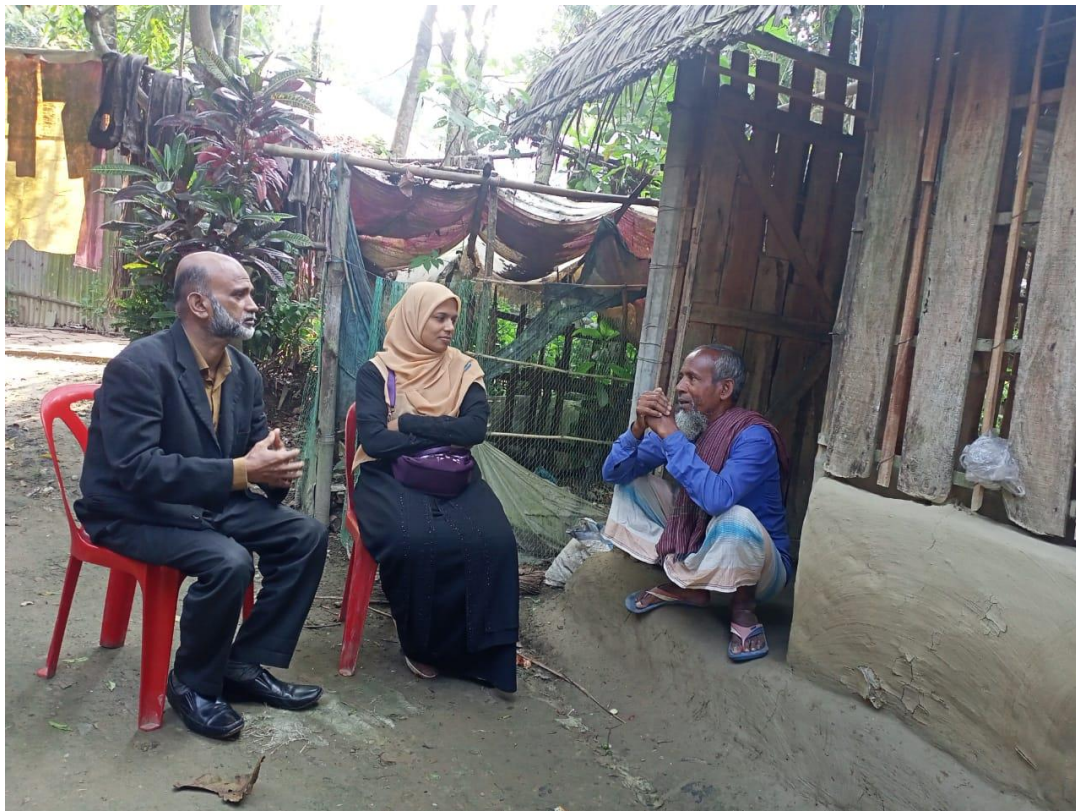
Picture-12: Household visit by the Executive Director of NISA at Moddyadaga village of Fultola Upazilla of Khulna district in Bangladesh in November, 2021.