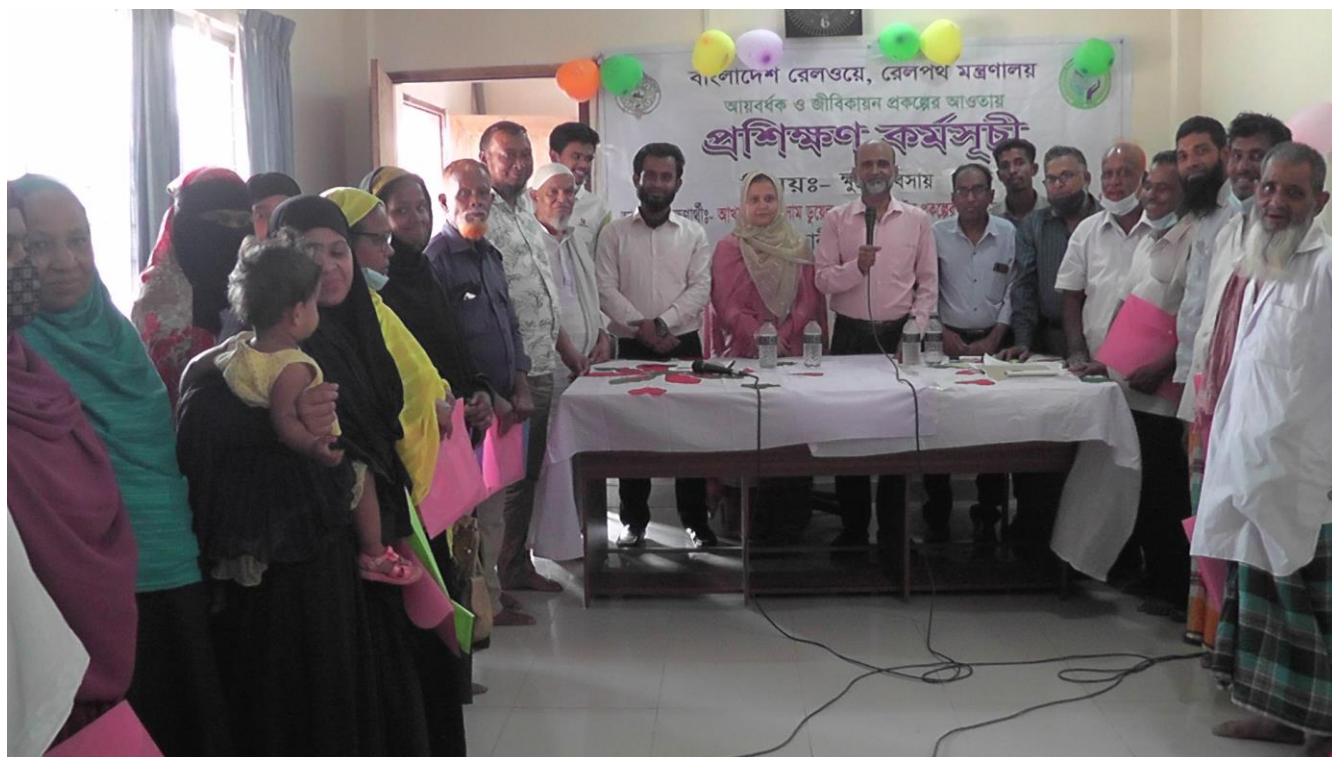
Picture-18: Closing session of 5 days training on business skill development to affected beneficiaries of Akhaura Laksam Double Line Project(ALDLP) of Bangladesh Railways by Executive Director, NISA.