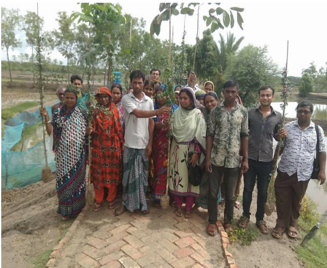
Picture 3: Campaign for roadside tree plantation by the local community for sustainable environment. Picture was taken from Jawakhali village of Shyamnagar Upazilla in Satkhira district, Bangladesh.