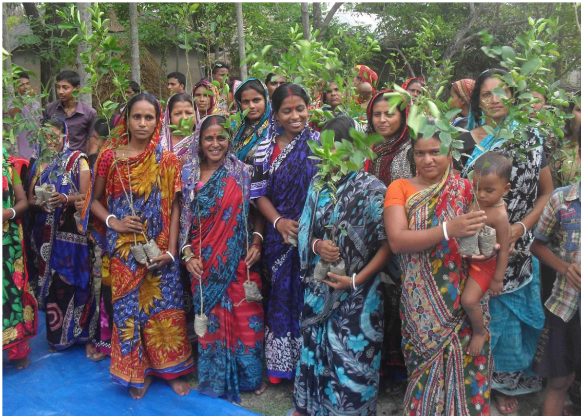
Picture-1: Campaign for tree plantation by the disaster vulnerable coastal communities at Shyamnagar Upazilla of Satkhira district in Bangladesh to protect river erosion, coastal surge and climate change adaptation.