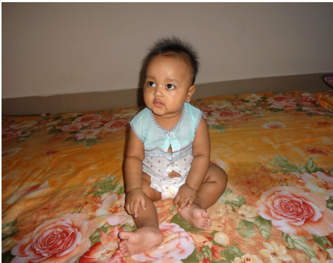
9. Child caring of working women by NISA in Dhaka, Bangladesh.