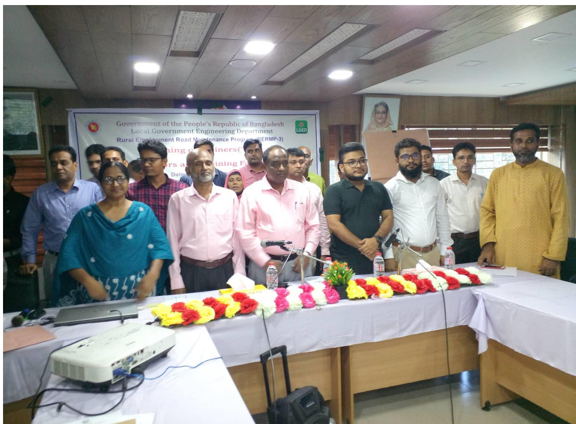
Picture-10: Closing session of 2 days TOT Training of RERMP3 project at LGED Cumilla. Executive Engineer along with ED of NISA and other participants attended the course. Picture was taken on 8 September, 2022 at LGED Cumilla Training room.