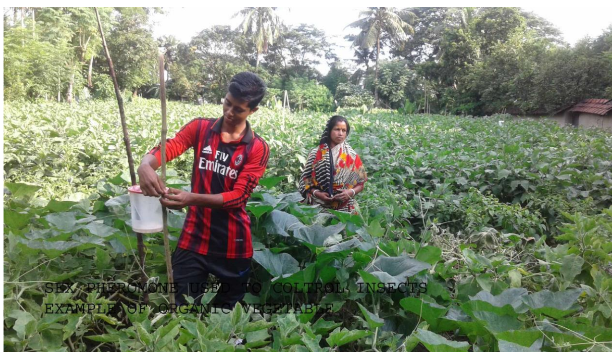
Picture 4: A local youth along with a woman farmer is setting sex pheromone trap at vegetable garden for pest control management. The photo was taken from Shakarkathi village of Shyamnagar Upazilla of Satkhira district, Bangladesh.