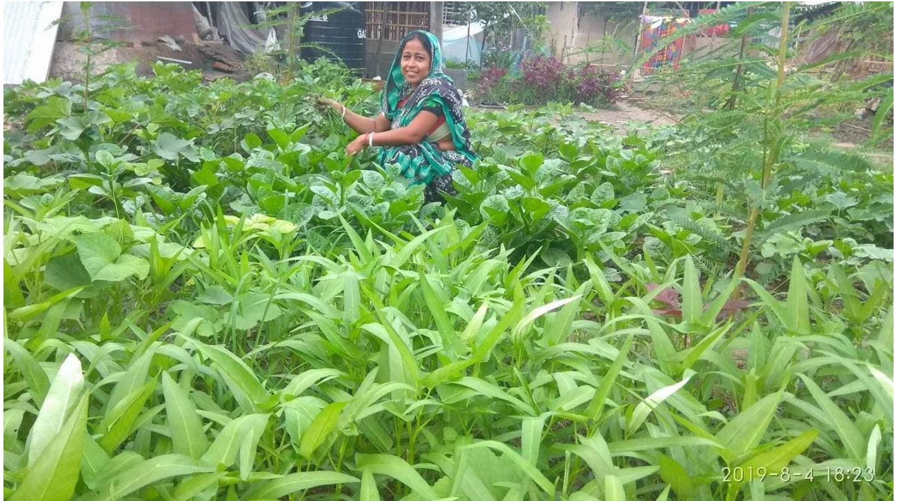
Picture 7: A farmer of NISA with a smiling face at her homestead vegetable garden in Satkhira, Bangladesh.