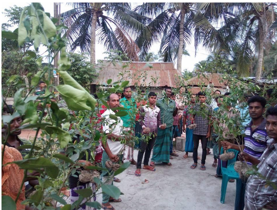
Picture-19: Movement for roadside tree plantation by the local community of Rampal, Bagerhat, Bangladesh for building a disaster resilience community.