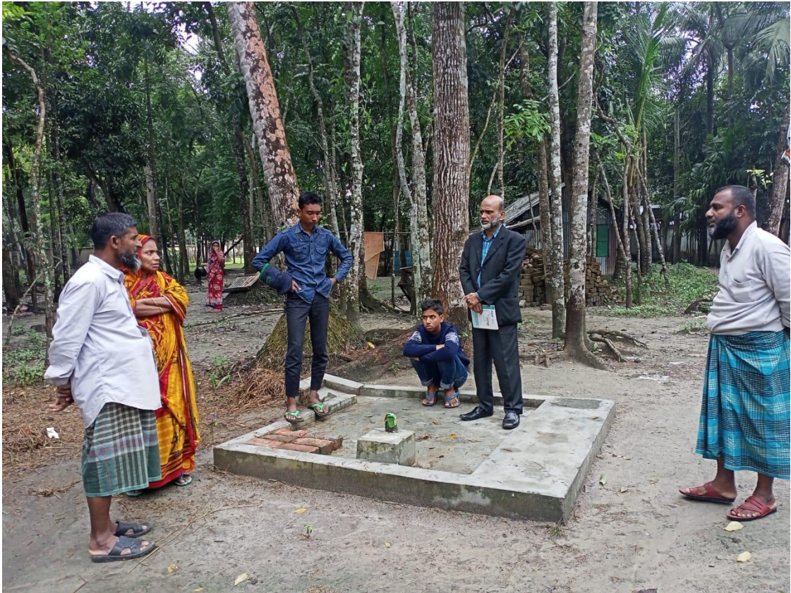
Picture-13: Discussion with the low income community for tube well repairing at project area. Picture was taken from Fultola, Khulna, Bangladesh in October, 2021.