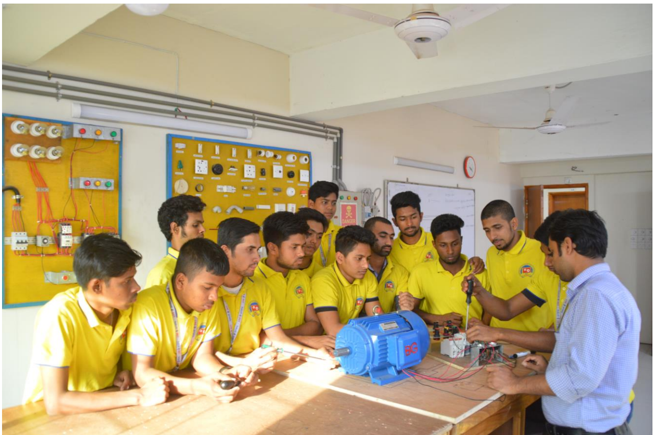
Picture-21: Vocational training to marginal youth by NISA. Training held at DIST, Mirpur, Dhaka, Bangladesh