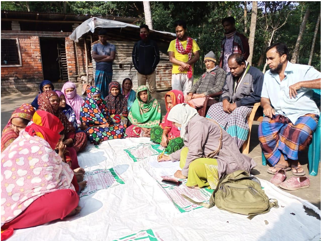
Picture-15: Group formation meeting with the community people by NISA's staff at filed level. Photo was taken from Moddyadaga, Fultola, Khulna, Bangladesh.