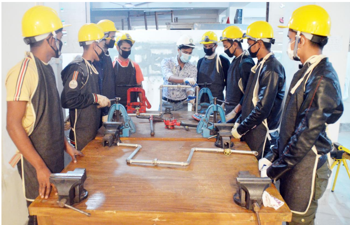
Picture-8: Plumbing training to youth by NISA for employment creation. Photo was taken from MAWTs, Caritas, Mirpur, Dhaka, Bangladesh during practical training.