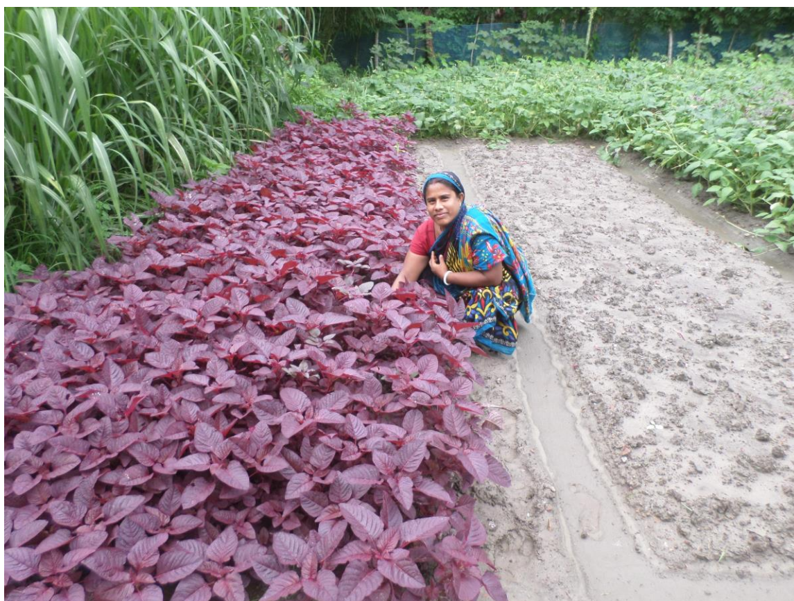
Picture-6: A vegetable grower of NISA is caring her vegetable garden. Picture was taken from Deol village of Shyamnagar Upazilla in Satkhira district, Bangladesh.