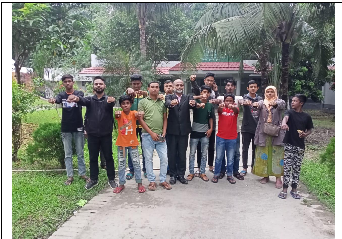
Picture-11: Youth and Adolescents of NISA's working area are making commitment for social work. The picture was taken from Moddyadaga village of Fultola Upazilla of Khulna district in Bangladesh.