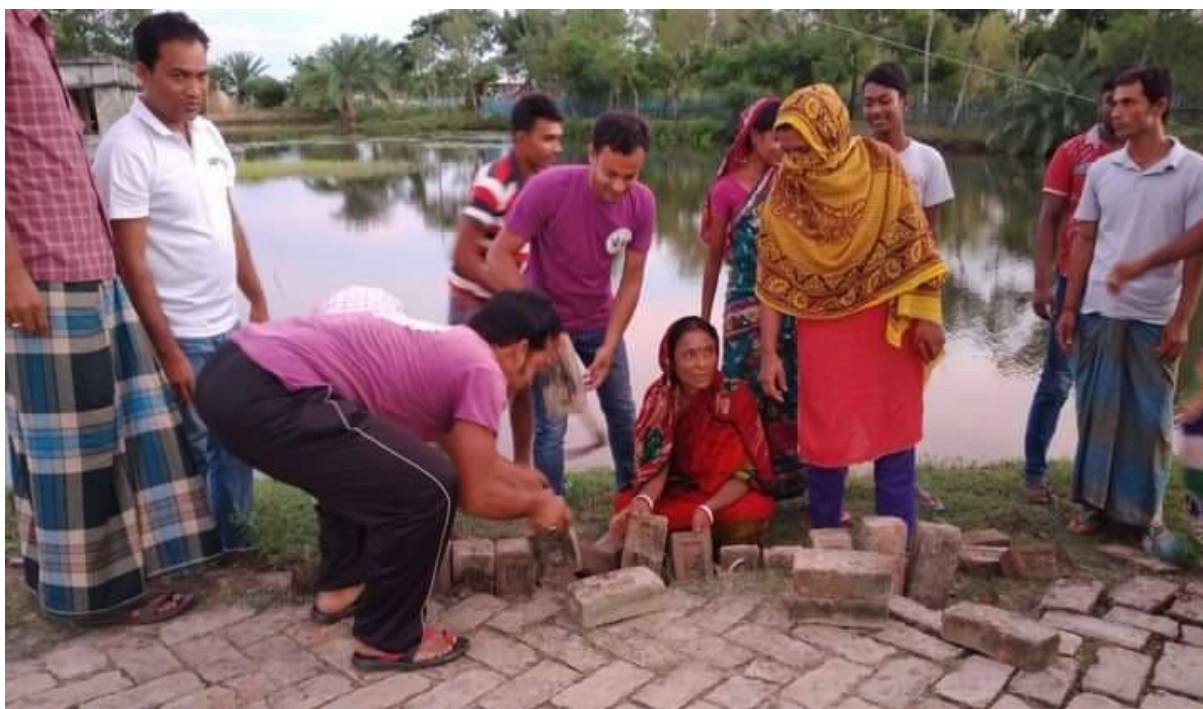
Picture 2: Local youth of NISA are repairing herringbone (Voluntary work) at Jawakhali village at Shyamnagar Upazilla of Satkhira district in Bangladesh.