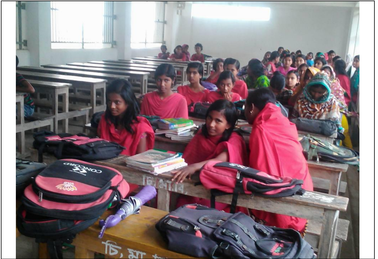
Picture-20: Girls education program for marginal adolescents by NISA at Shyamnagar Upazilla of Satkhira district in Bangladesh.