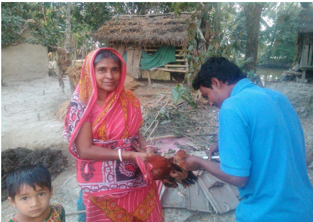
Picture-5: Community livestock vaccination by a local Paravet of NISA at Betangi village of Shyamnagar Upazilla in Satkhira district, Bangladesh.