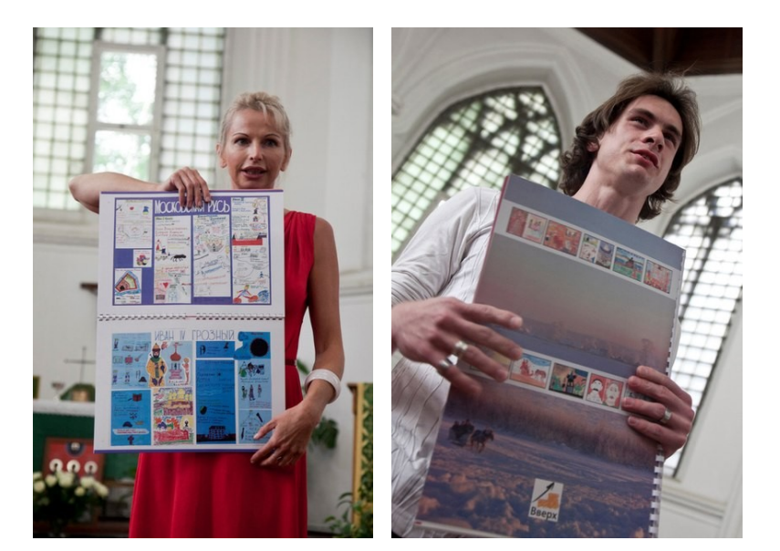
Presenting the History in Drawings album

There was one particularly important event that happened during graduation – the results of the first part of our project "History in Drawings" were revealed. Those of our students who live in psychoneurological institutions were given albums consisting of the sketches of historical events that they have done during their history lessons.