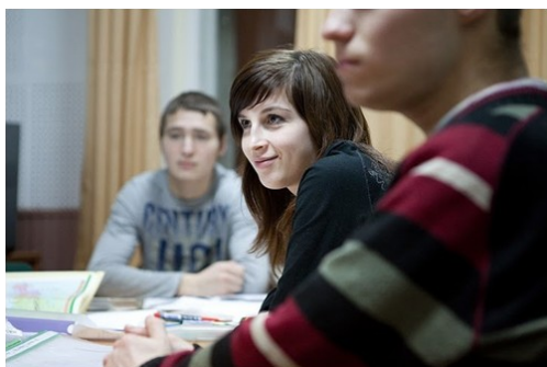
Russian in Group 9

The students from group 9 passed all their exams and will be allowed to take their final examinations. Their success was due