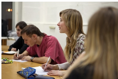
Chemistry in Group 11

Group 11 is now on the home straight. Four students out of five passed their exams and will continue to work hard in order to pass their Unified State Examinations at the end of the second term.