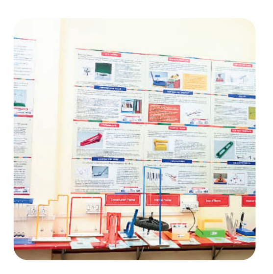
STEM Lab Installed