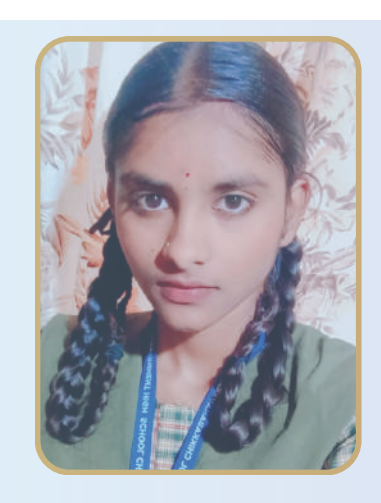
WASH COMMITTEE INITIATIVE

She has also educated her mother and her aunts on the tabbos and myths of menstruation