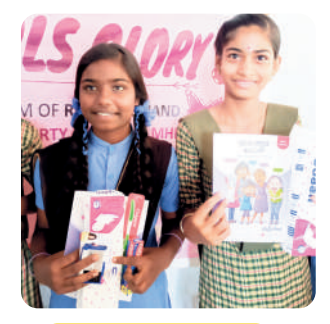
Sanitary pads & menstrupedia comic book distributed