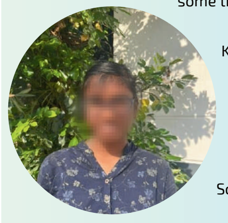
12 years old

Her hobbies include reading books and dancing.