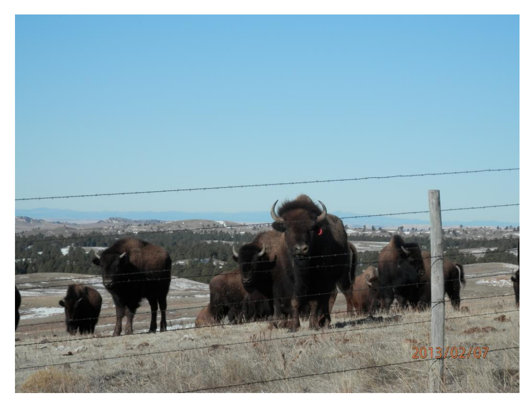
Knife Chief Buffalo Nation Organization, Buffalo Pasture, February 2013