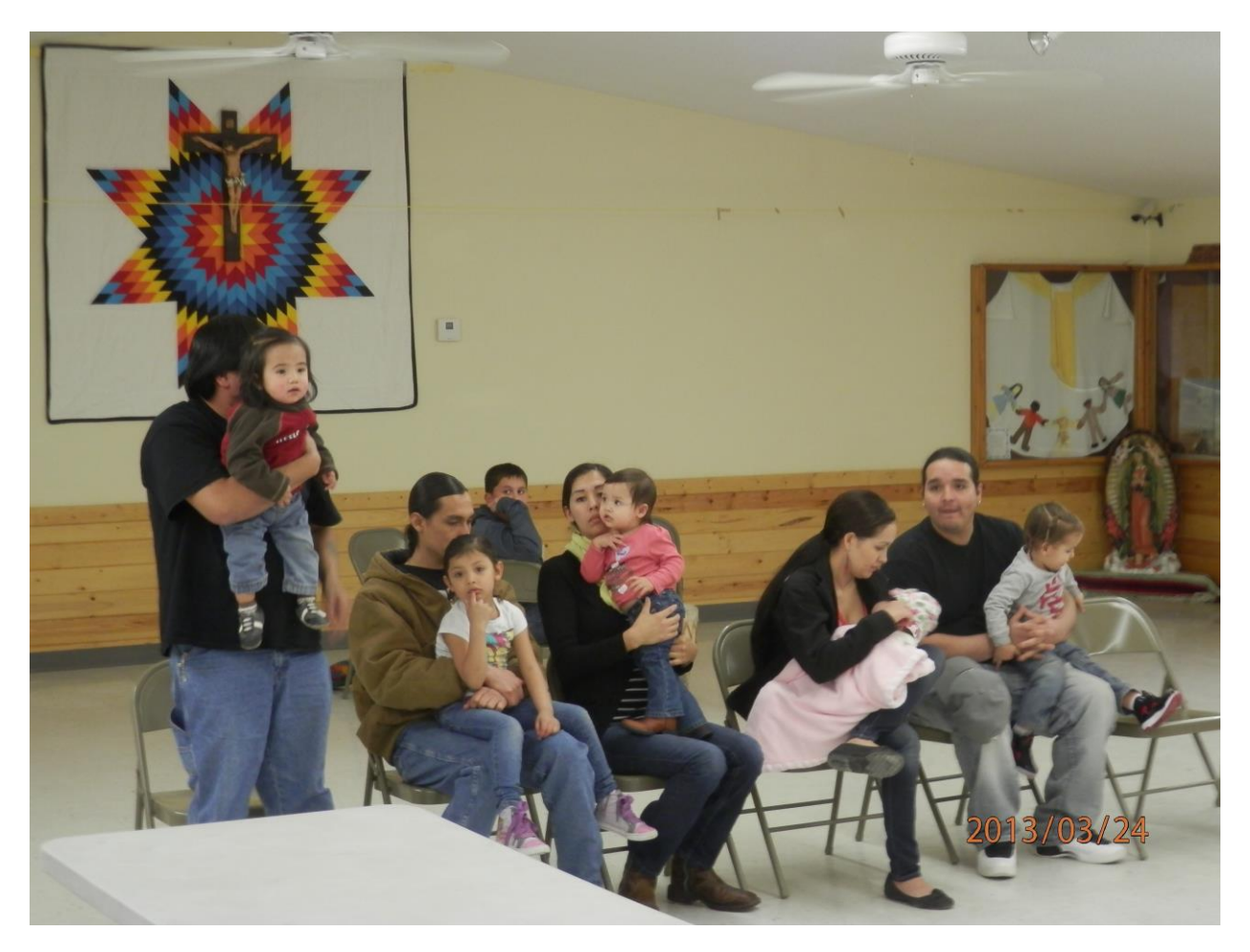
Waiting for the Welcoming the Babies ceremony to begin March 2013

February 2013 – a partnership with Students Shoulder to Shoulder organization was formed. This international organization send teams of youth to various communities around the globe to assist with community development and as a cultural exchange. This organization will send youth to the Knife Chief Buffalo Nation Organization in Porcupine to assist with preparation for the summer ceremonies and the fencing of the buffalo pasture.