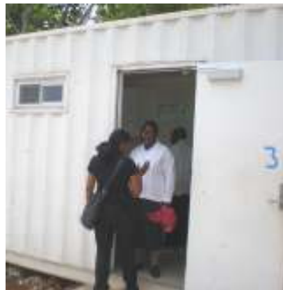
"Clinic in a Box"