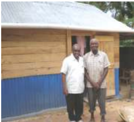
New homes for residents