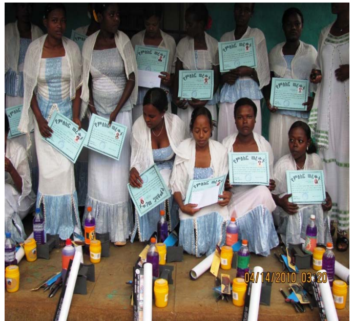
Graduates with tools and materials to help them start a business