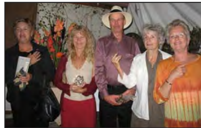
Members of the Kathmandu Klub celebrate the success of the Festival and receive recognition for their outstanding volunteer work.