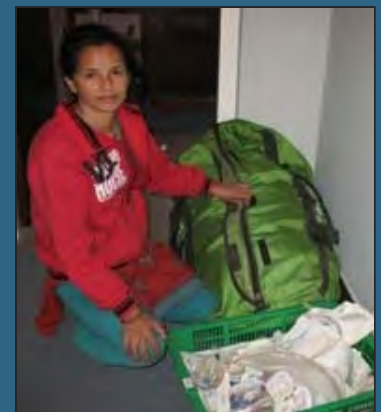
Some donated medical supplies are carried and delivered by volunteer couriers. Larger pallet shipments are collected and distributed when they arrive in Kathmandu.

CMAF is currently raising $7,000 to ship $200,000 worth of donated medical equipment and supplies to reopen the Chisang Clinic in the village of Bhawanee in fall 2011.