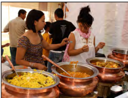
Delicious traditional Himalayan dishes were freshly prepared and served at the Festival.