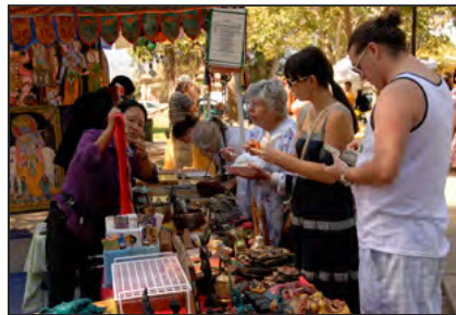
Vendors sold a wide array of hand-crafted and imported items.