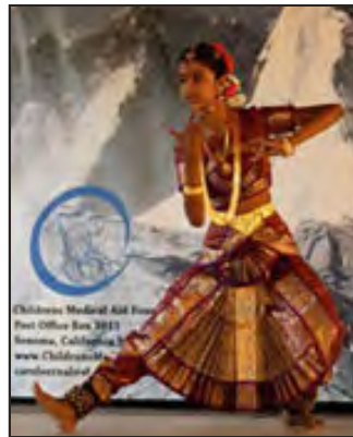
Dancers and musicians performed throughout both days.