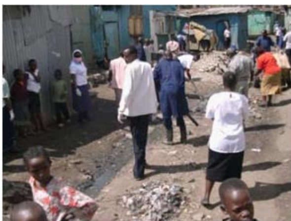
Community Health Workers at a clean up exercise

COMMUNITY HEALTH WORKERS are a wonderful asset to the Community Based Health program. In 2010 MPC trained 287 community health workers, who now contribute their voluntary services to assist the nurses who move around the villages to bring services close to the people.