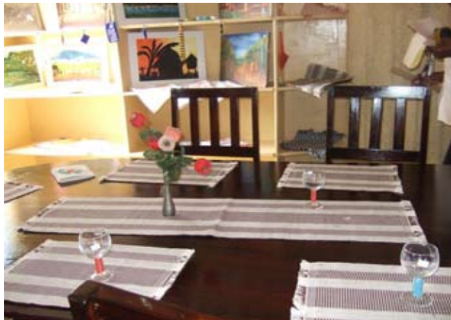
Opening of Skill's Retail Outlet

THE PRODUCTION UNIT associated with the Skills training centre provides piece work for some ex-students from the program. The unit makes many of the school uniforms for our schools, for the skills training students themselves and for the staff. The opening of a sales outlet is an incentive to improve the quality of items produced and contributes to the sustainability of the program. Current students also