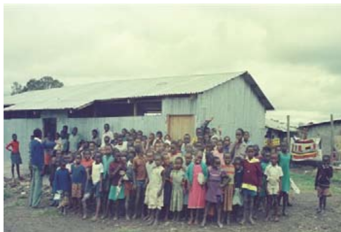
First School at Kayaba

TOTAL ENROLMENT IN the four schools reached 5,000. Mukuru Kayaba school moved into the fine brand new permanent buildings on the original site of MPC's first informal school in Kayaba.