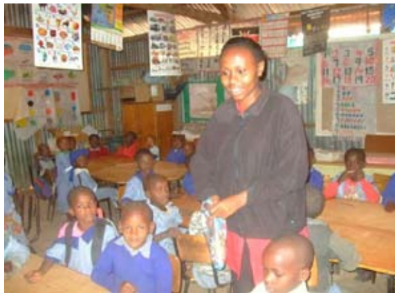
Early Childhood Class

EARLY CHILDHOOD EDUCATION and development is vital if a child is to be well prepared for primary school and for life-long learning. MPC has early childhood classes in the four primary schools as well as giving support to twelve day-care centres in the villages.