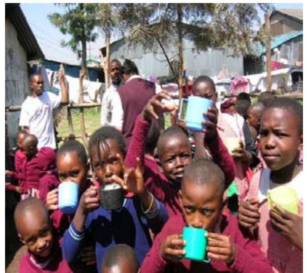
One of the Village Day Care Centres