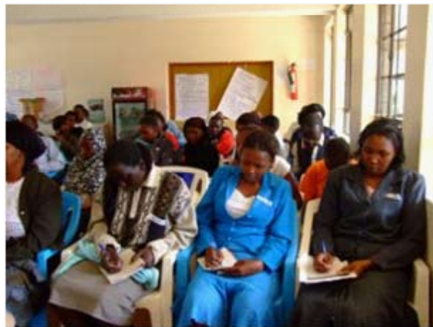
Community Health Workers in Training

WE REACHED THOUSANDS of beneficiaries through a variety of health services and activities, including the clinic; mobile community health service; education programs and health camps. Our partners and donors enabled the provision of education on prevention and living productively with HIV/Aids, training of community health workers, nutrition, and ante-natal education. A new pediatric service catering for children from 0 to 12 years was commenced with the support of Medicines for Humanity. This services is blessed with the benefit of a Pediatrician for one session per week.