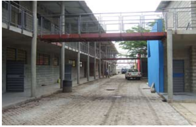
ST Eliabeths under construction