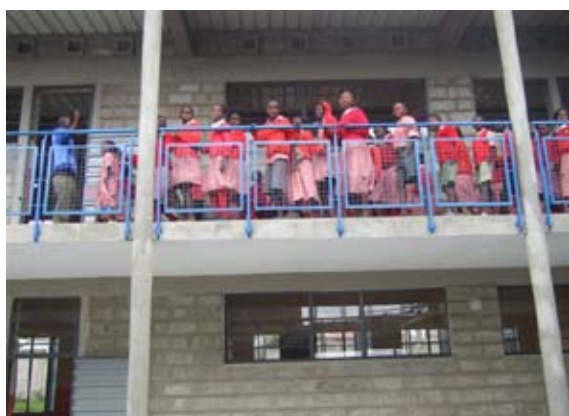
New Kayaba School

THE CONDITIONS OF St Elizabeth remain very difficult while the construction continues but all look forward to the day when they will occupy the new school. However, the conditions did not prevent the choir from performing very well, as usual, in the national competition for schools.