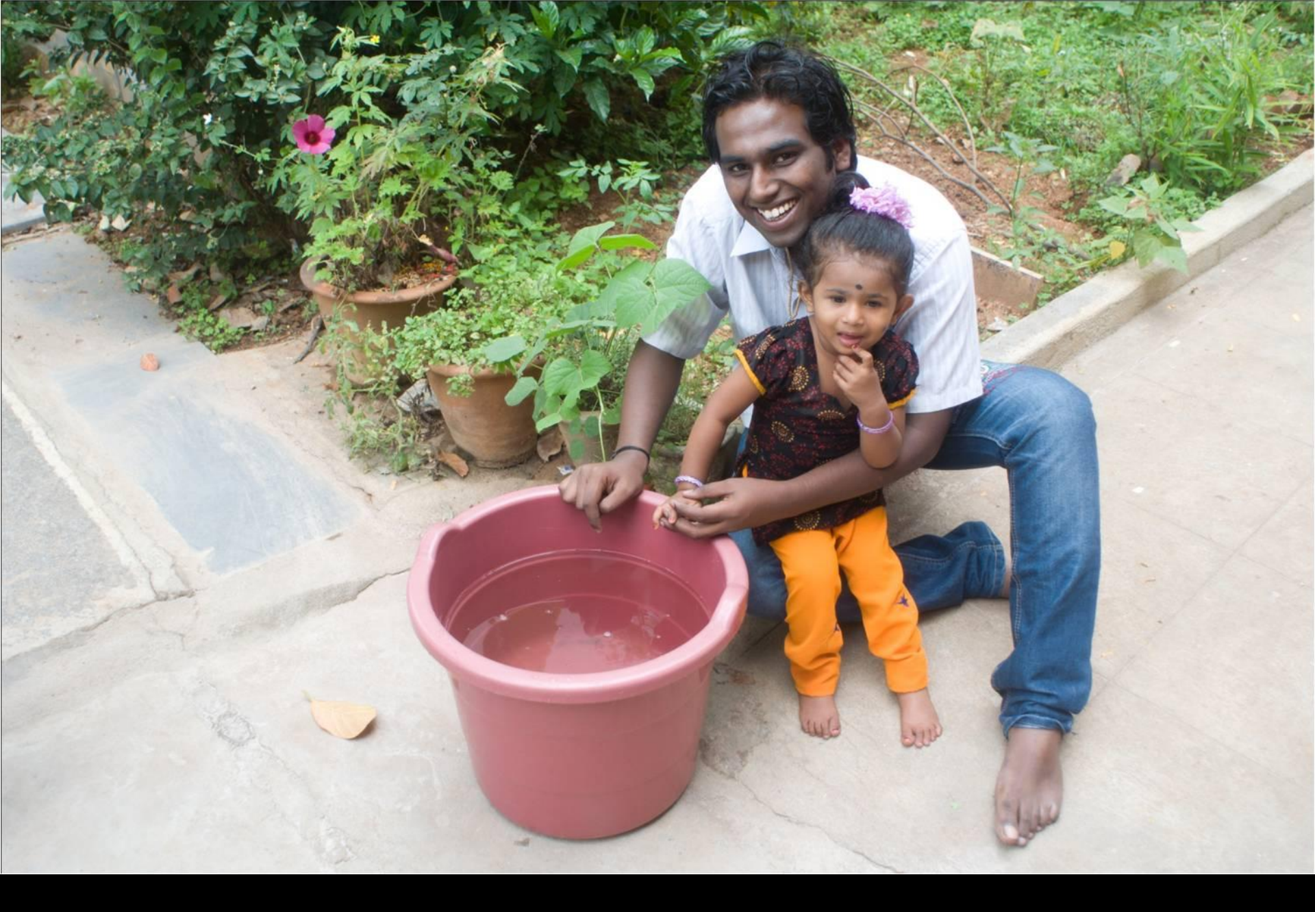
...which will put green on the top of houses and save water.