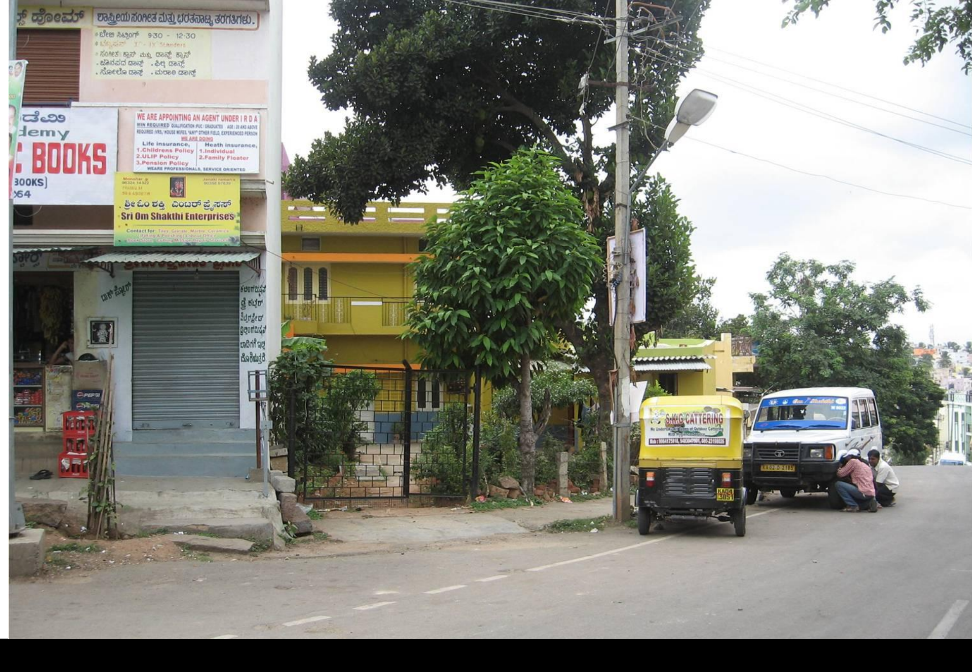
Rajesh lives in Kurubarahalli, a suburban area in Bangalore