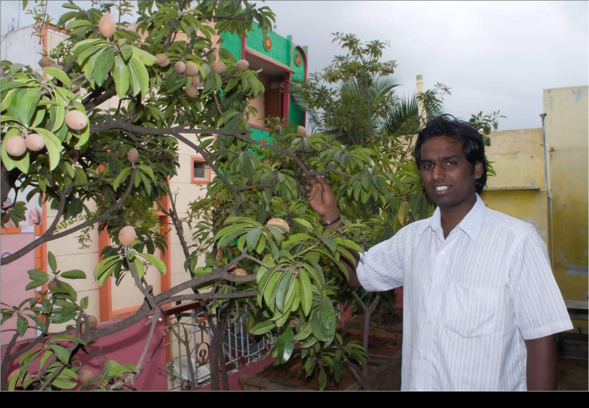
He has set up two small urban farms in his neighbourhood