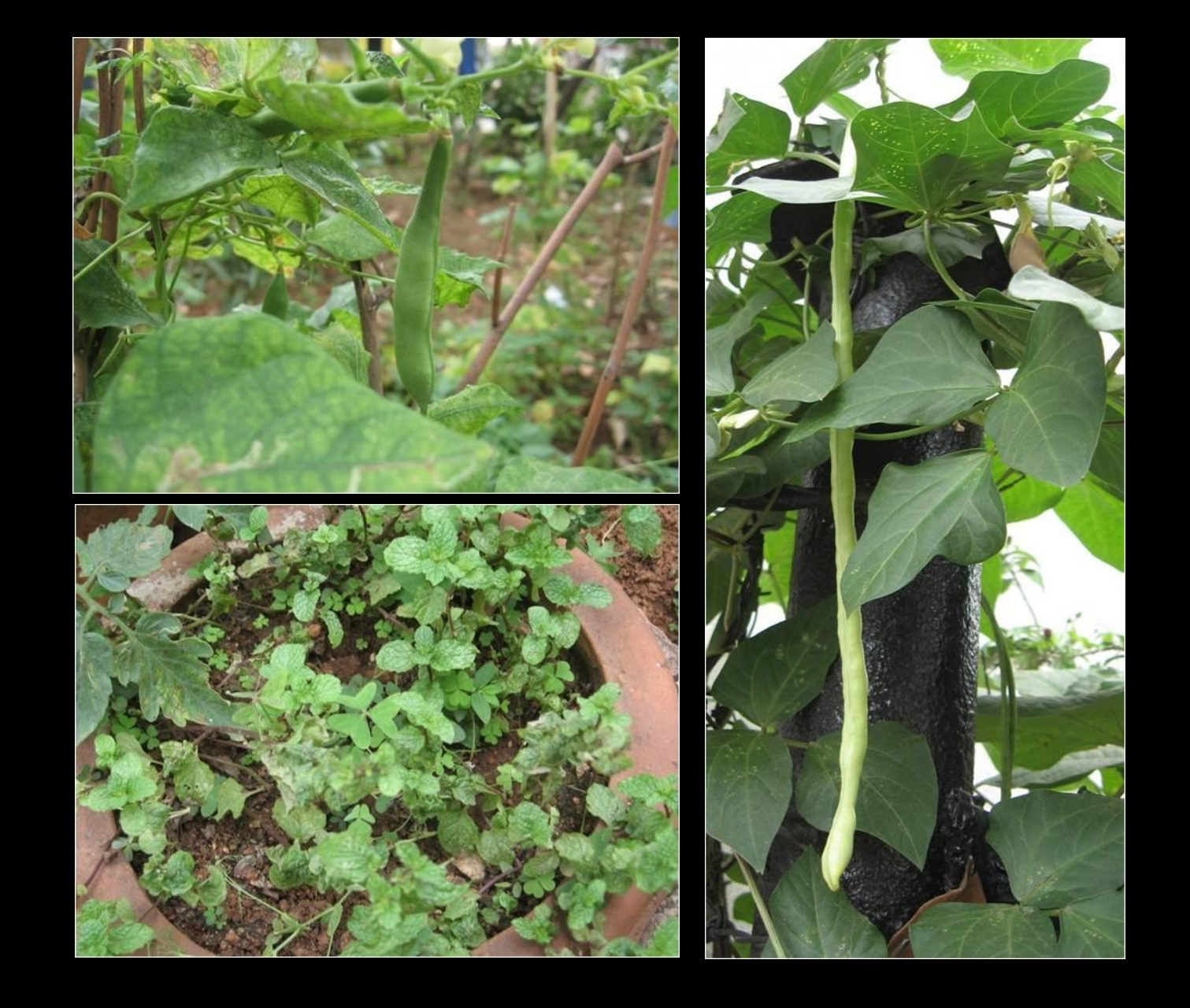
They have organic vegetables (better quality than available in the market) and they save money.