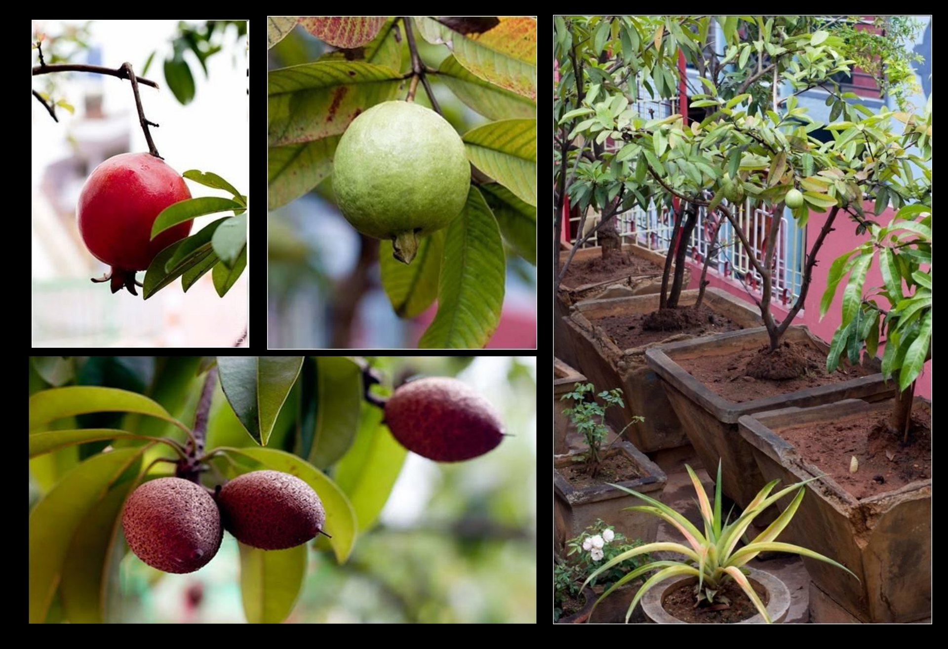
They have regular supply of healthy, organic fruits....