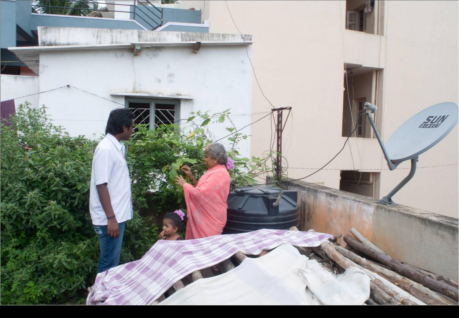
The idea is a success and customers are happy.