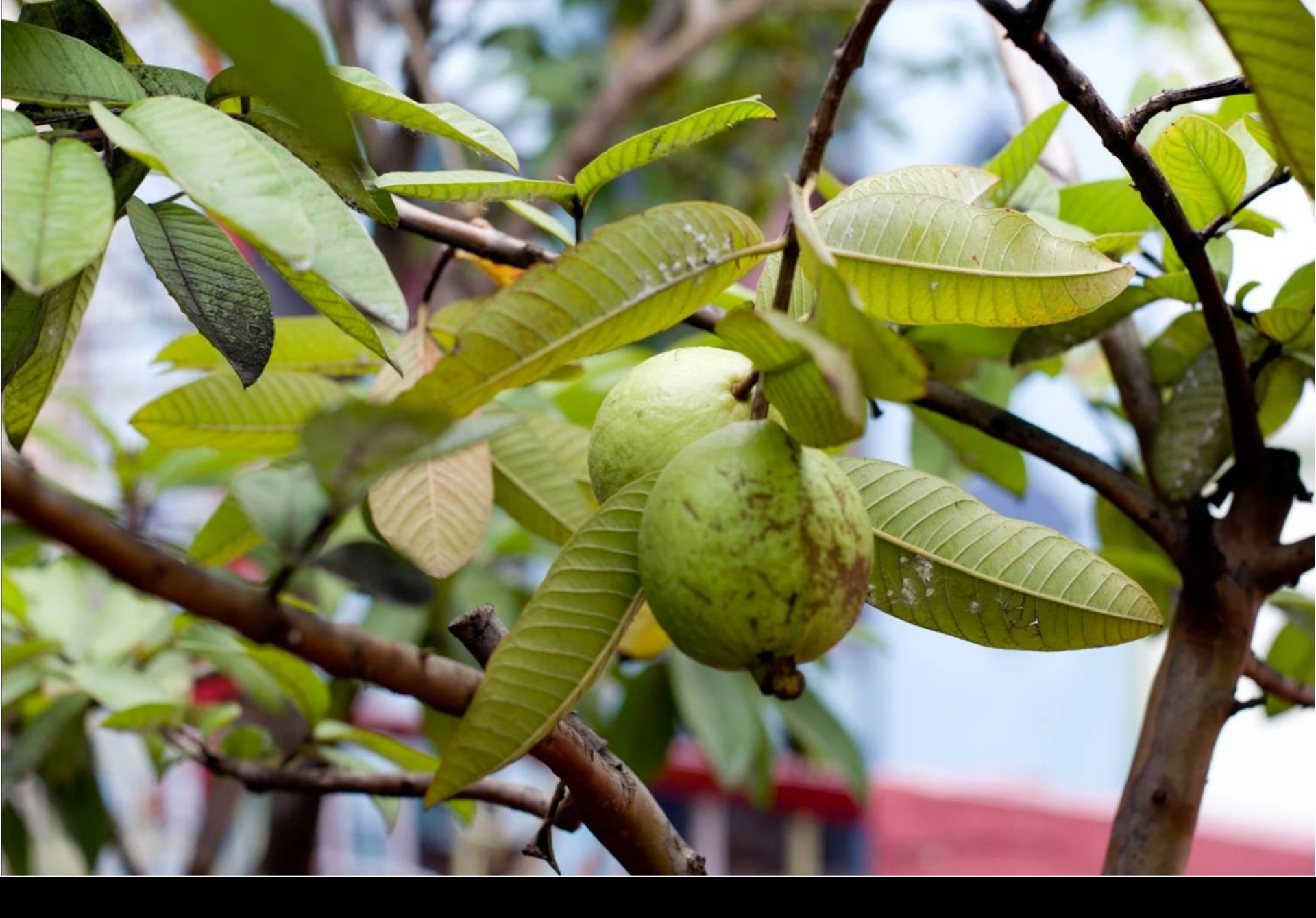
Imagine if Bangalore went from grey to green...