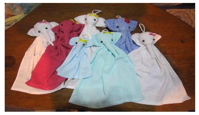
■Yamagata Lifestyle Club Cooperative × Civic Force

political policies to self-governing bodies in the affected areas. They were able to realize the nearly complete transfer from refuge shelters to temporary housing by the time of the Bon Festival, and the "Stay Strong Elephant" campaign is being held at an increasing number of temporary housing meeting places. This campaign prevents isolation and connects people by bringing them together with handicrafts to make the "Stay Strong Elephants" and allows them to make new acquaintances. Participants who were worried that the move to temporary housing would bring with it the end of social contact say, "I feel very grateful when I think of how much fun I had making things with others."