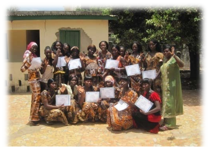
Group Photos of Graduates

The items produced by the girls were put on display and included tie and dye and batik, soap-making, and soap powder and handmade bags. Also, the students were taught on how to make certain food items during the training.