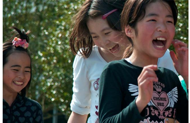
Comfort for Kids uses play and other therapies to help children heal after a disaster.

We partnered with Peace Winds and Nike to introduce Moving Forward, a program that uses sports to help young people recover physically, socially, mentally, and emotionally from traumas associated with disasters.