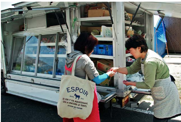
Mobile shops brought goods to the people and helped commerce resume.

We distributed vouchers that survivors used to purchase essential goods from local merchants. People prioritized their own needs while supporting local economies. And, we started a bus program to allow survivors to shop for supplies and essential services, like medical care and banking.