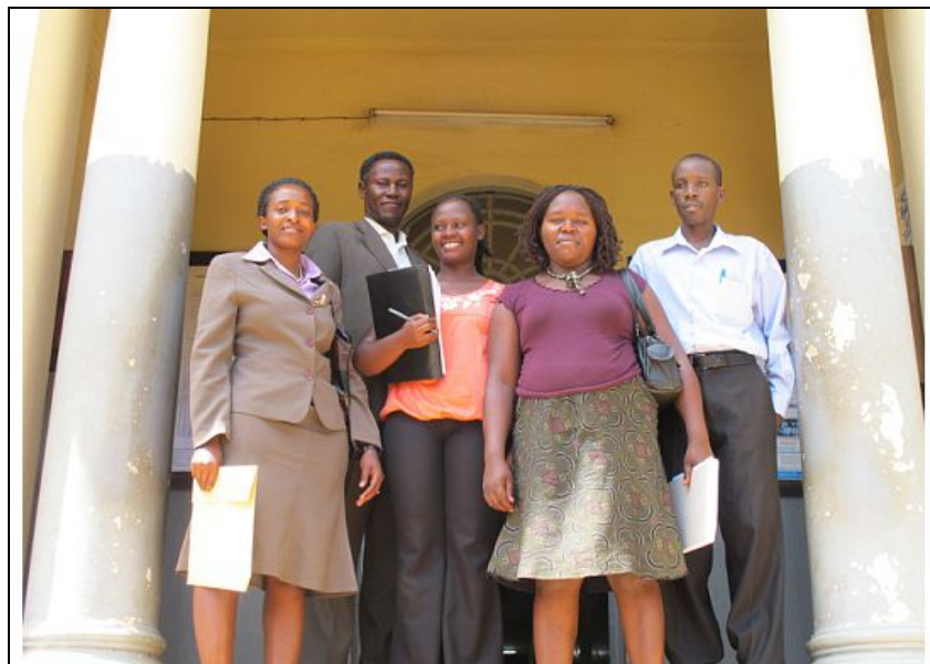
Gender Action workshop participants from NAWAD prepare for meetings with district health and World Bank officials, Jinja, Uganda