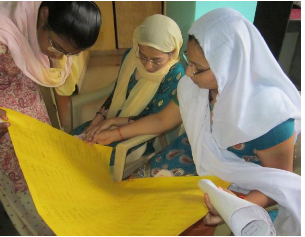
Activity based learning- Students of Computer course