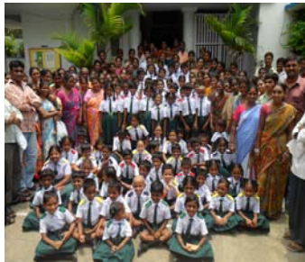
Vizag – Olivet School