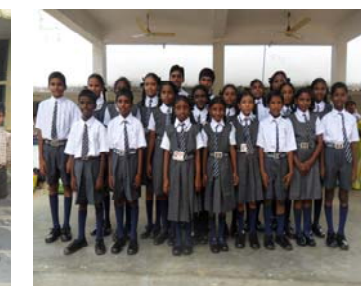
Kesanapalle – SDA School