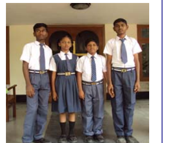
Hyderabad - SDA