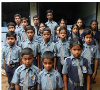
Vizag – Sribhavana School