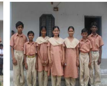
Chirala – Gowthami School