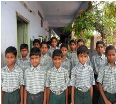
Nizamapatnam – AlQuamar School