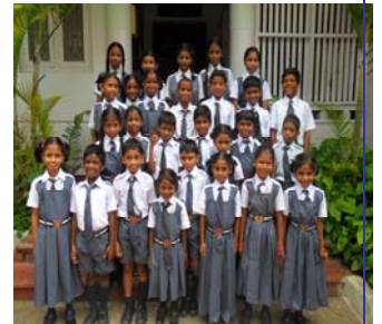
Vizag – SDA School