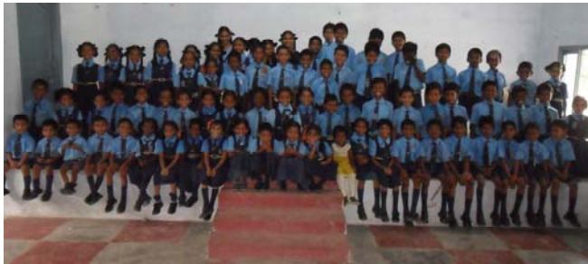
Mandadam – Golden Rule School