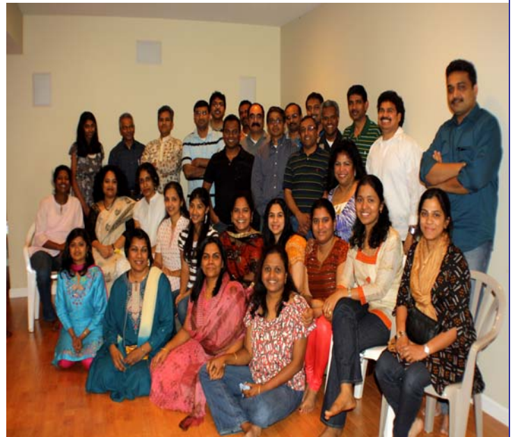
Uplift a Child – New Jersey-USA, 7 th May 2011

As of December 2011, we have 350 sponsors from 9 countries. Most of our sponsors are not rich. 99% of them belong to middle class families with a hand to mouth income. We are very privileged to have them on our team. They have come out of their way to make a difference in these children's lives through their gift of education.