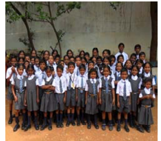
Rajahmundry – SDA