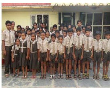
Pedalanka – Swathi School