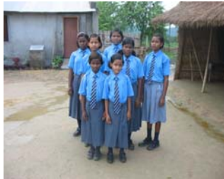
Bisunpur Children in Jharkhand state, India