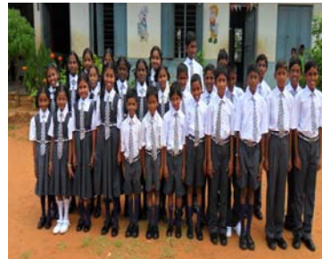
Vizag – SDA MVP School