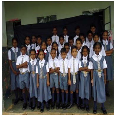
Tenali – SDA School