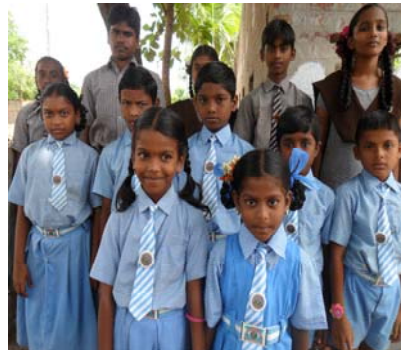
Nizamapatnam – Pragathi School