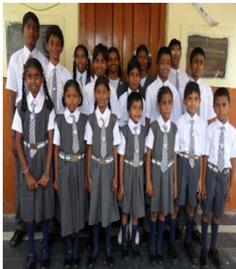
Vijayawada – SDA School