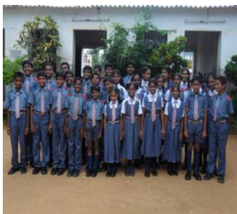
Vizag – Trinity School