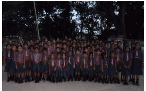
Tuni – Apollo School