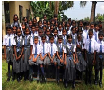
Pitapuram – SDA School