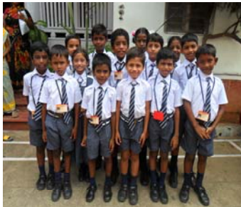
Vizag – JGS School