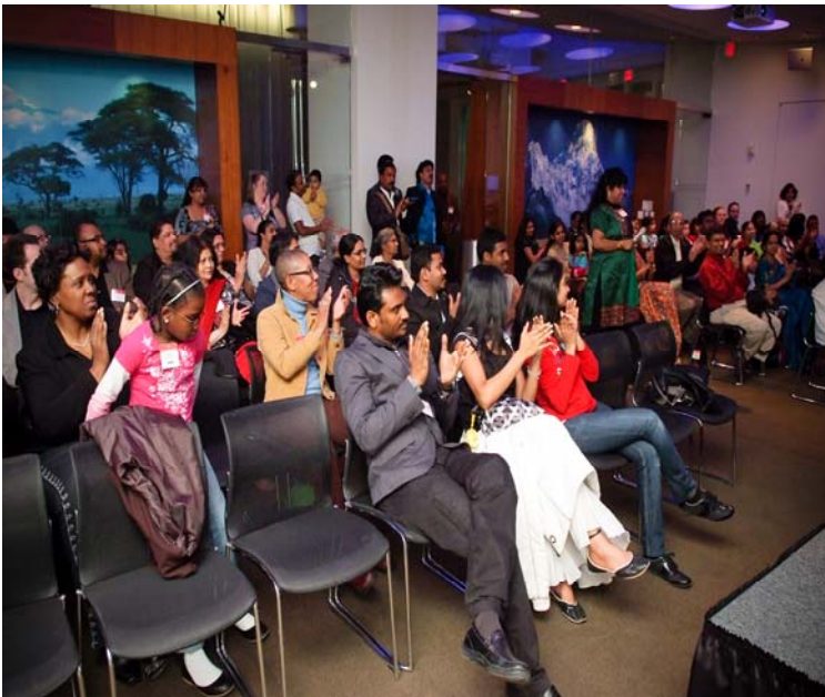
Uplift a Child – Maryland-USA, 12 th March 2011

We conducted our annual sponsors meetings in New Jersey and Maryland states in 2011. We provide full details about all our children, a summary of their development, a summary of how every rupee or dollar has been spent and share some of the success stories and discuss on how we can improve the children's lives. Each time we get together, we are growing with inspiration, dedication, support and friendship. Our sponsors are happy with our work as we updated them with a detailed presentation on each and every aspect of our operations in India and USA.