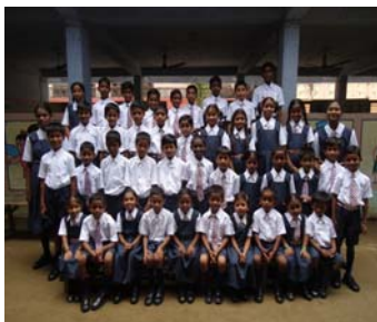
Bobbili – SDA School