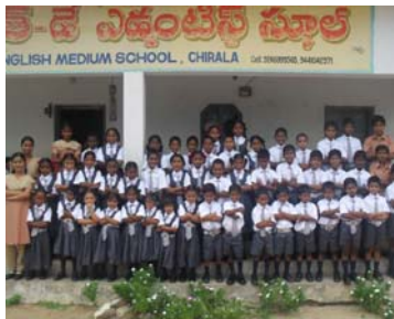
Chirala – SDA School