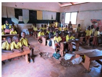
Existing classroom at Makwasinyi