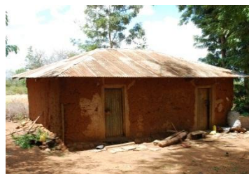
Existing teachers housing