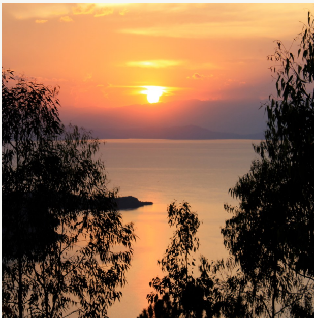
Sunset on Lake Kivu near CVK

In conjunction with these efforts, three separate teams of students within the Rwanda team are each designing their own school from the ground up. Because school construction is such an ambitious project, working as three separate teams will allow ideas to flourish independently of each other, ensuring that our team is able to glean as much information as possible to make this project successful. While the students design