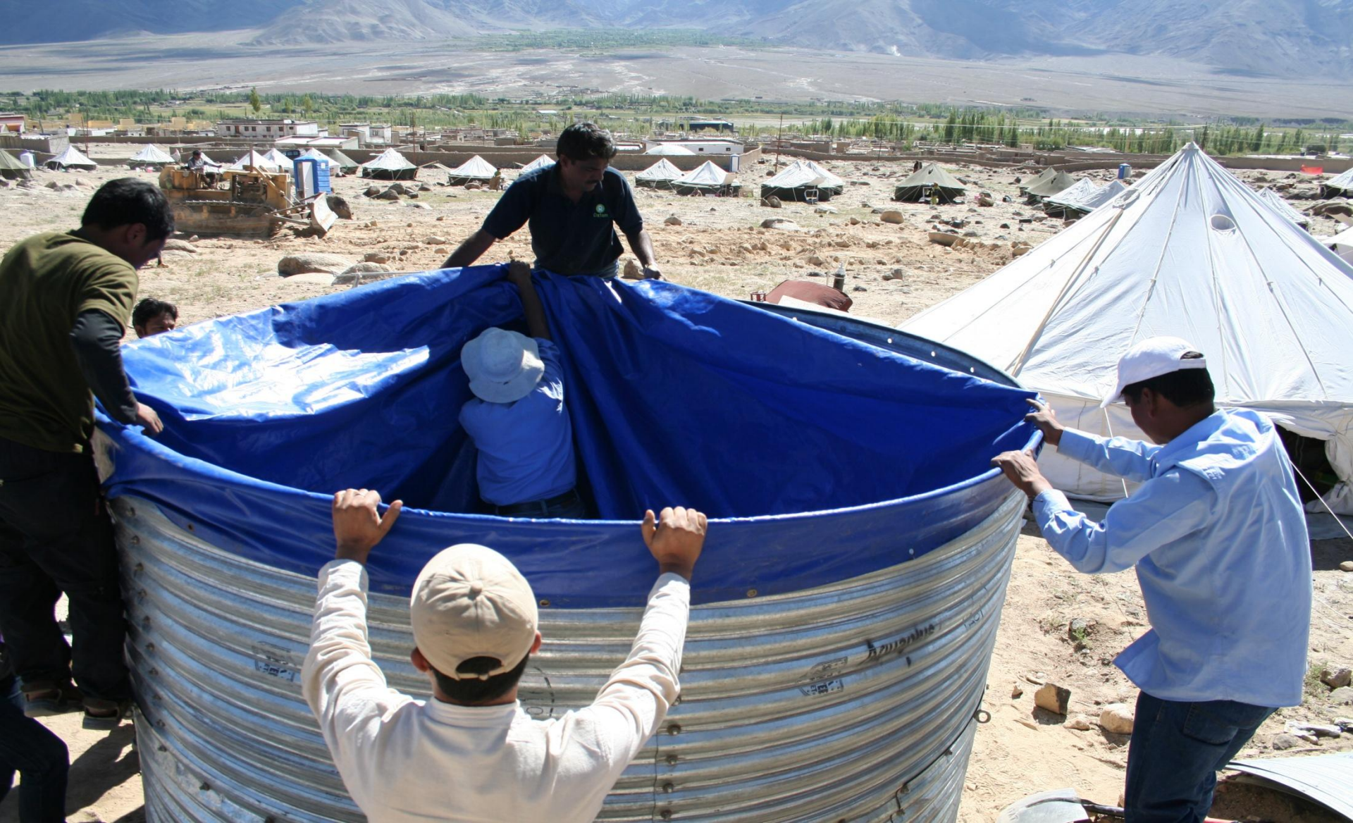
T -11 being erected in Solar camp