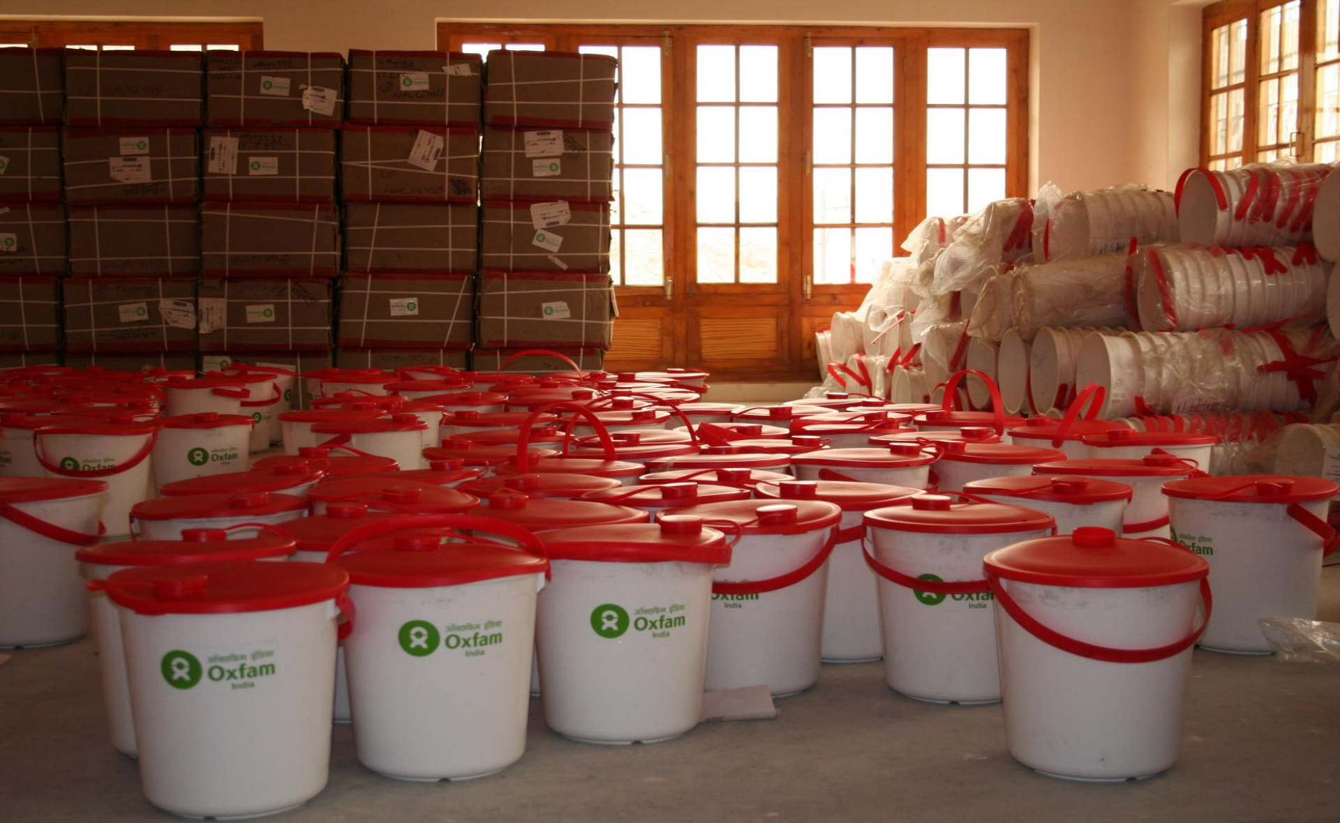
Oxfam India warehouse in Leh