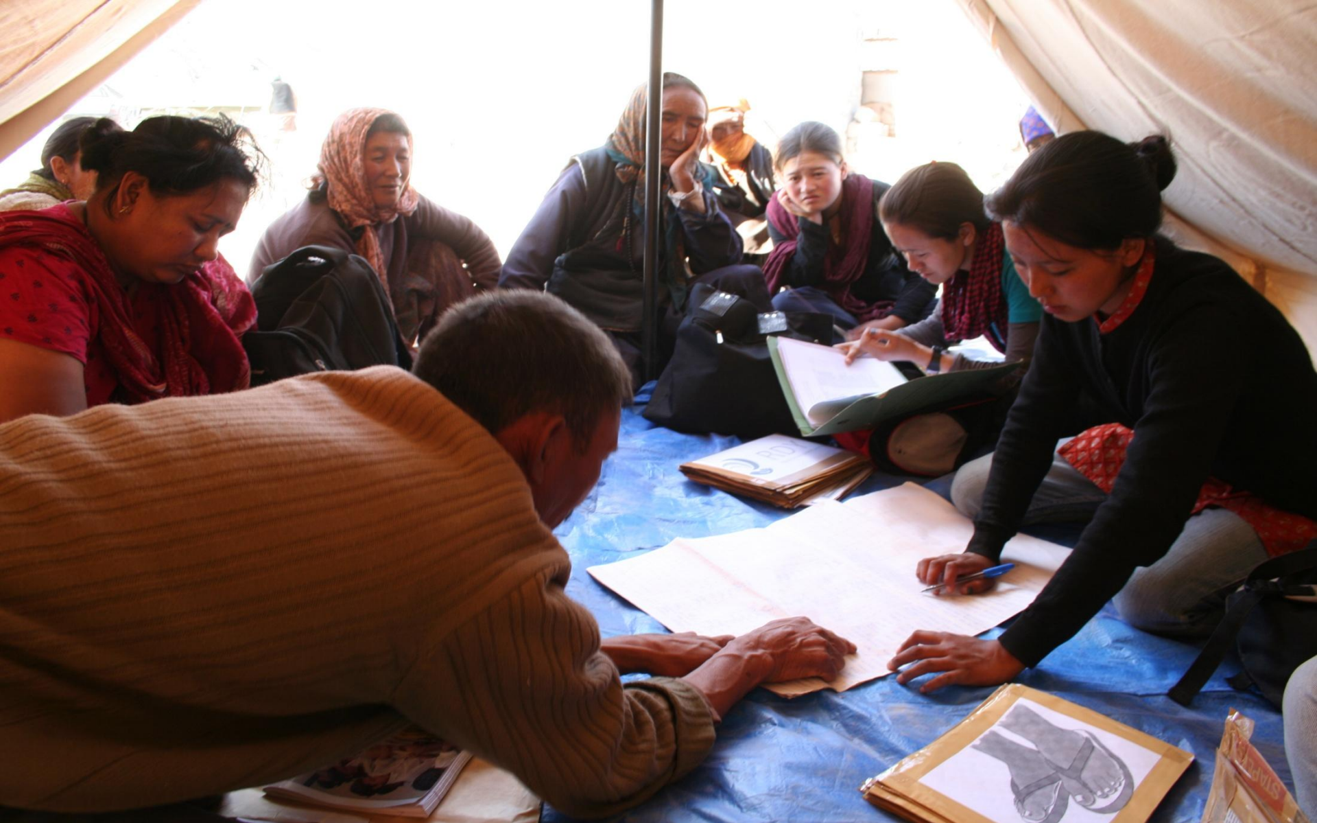
Hygiene promotion by PHP team