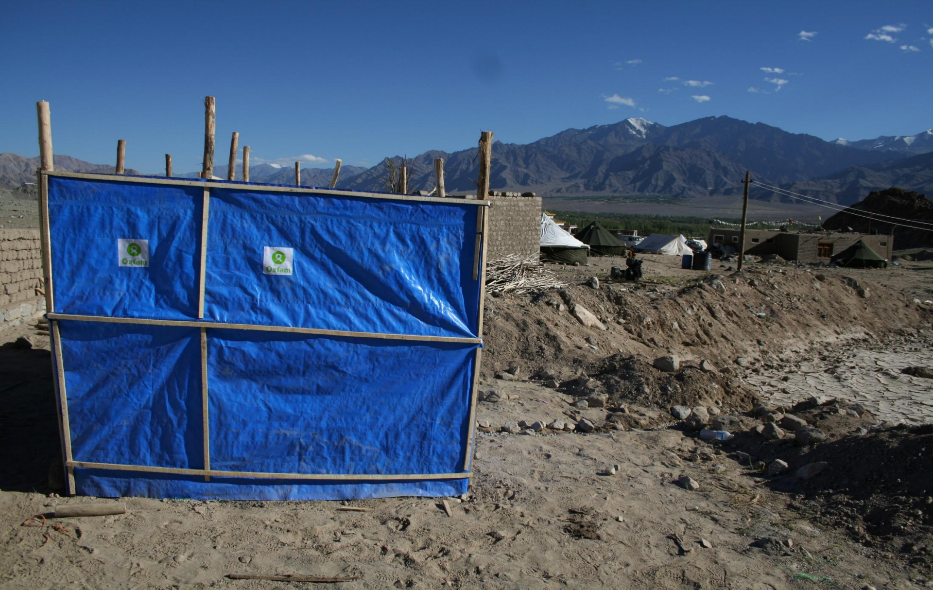
Latrines ready for use in Solar camp