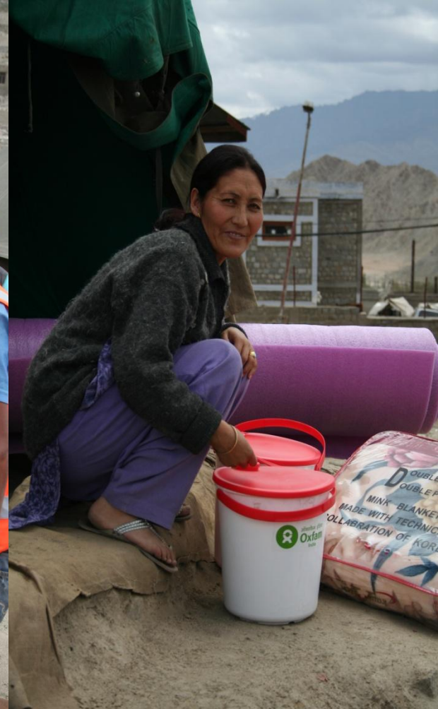
Distribution of shelter NFI and hygiene kit