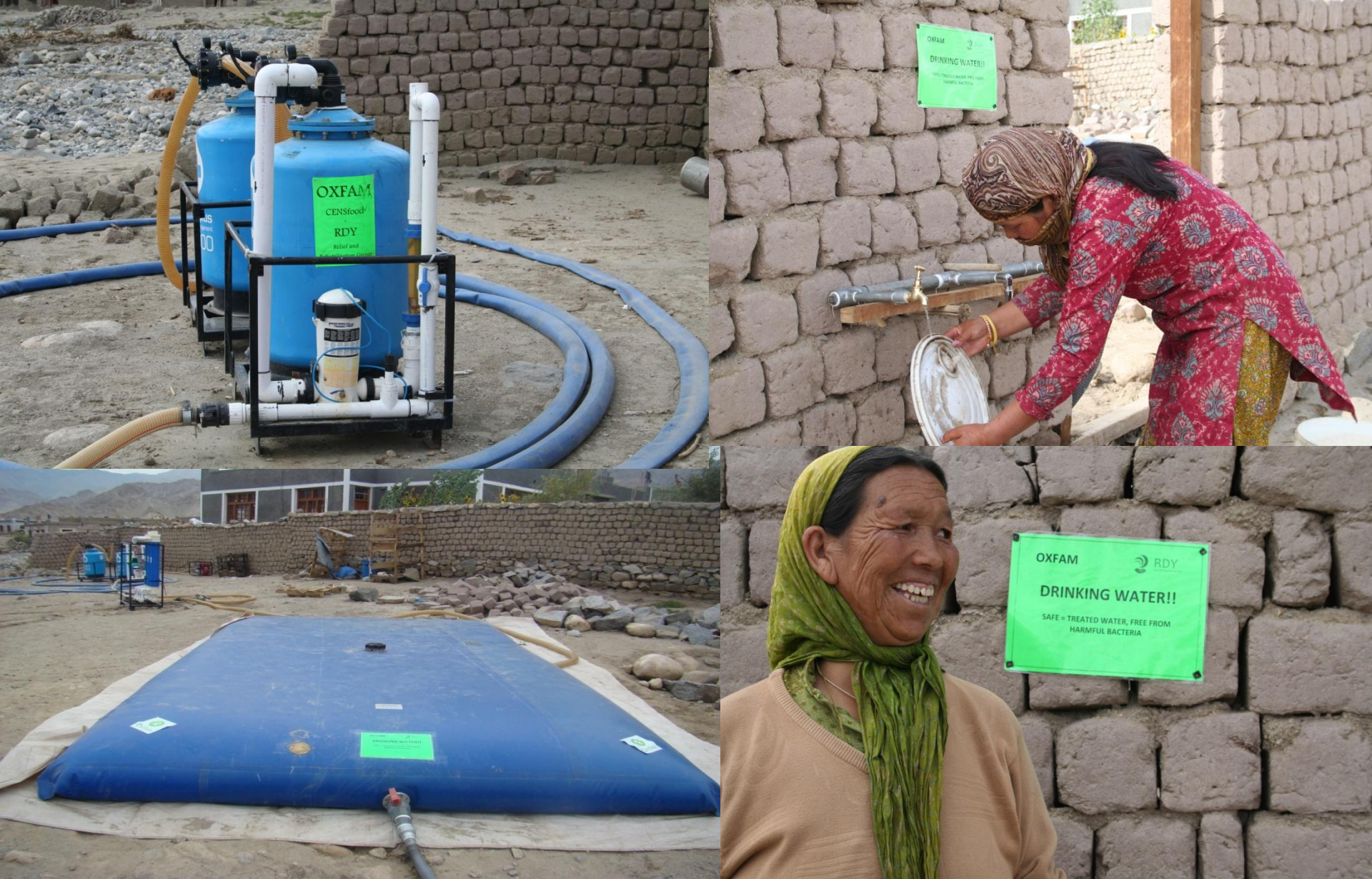
Water purifier Demanding Rights for All