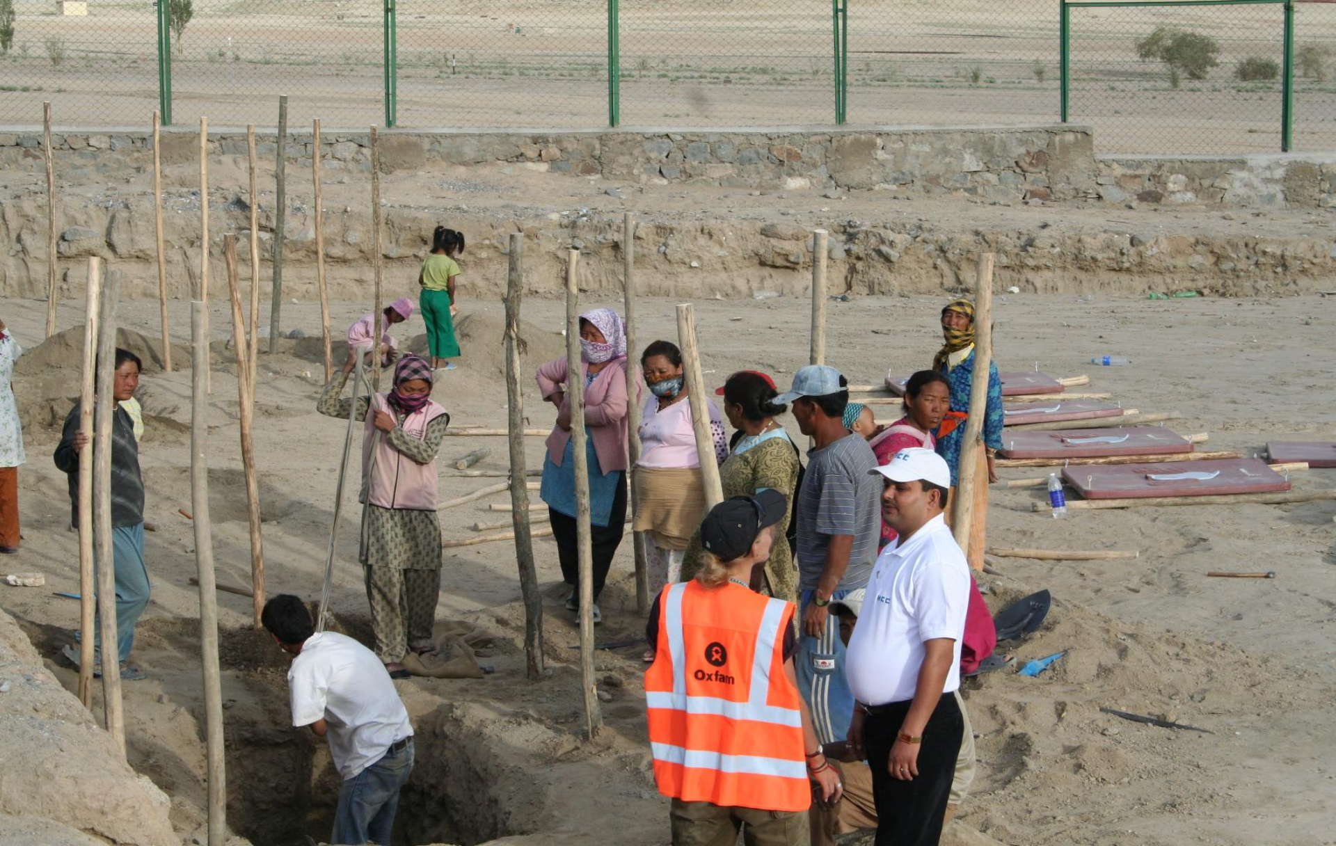
Dry pit latrines being constructed in an IDP camp