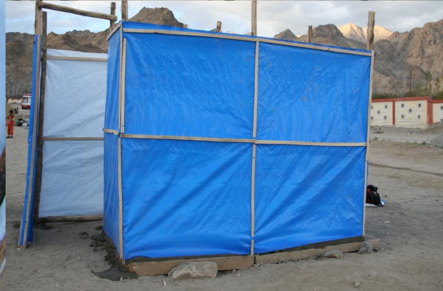
Bathing spaces ready for use