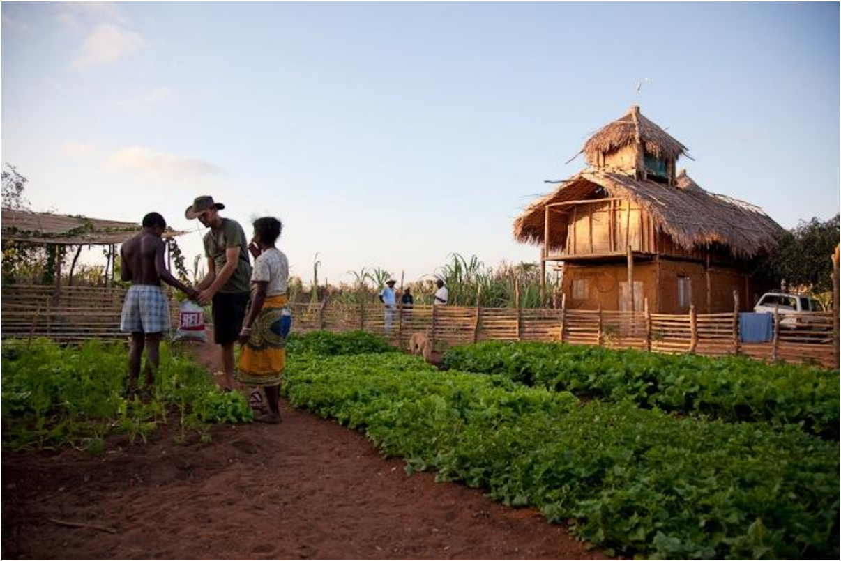
Realizing Ho Avy's mission: improving and diversifying agricultural opportunities.