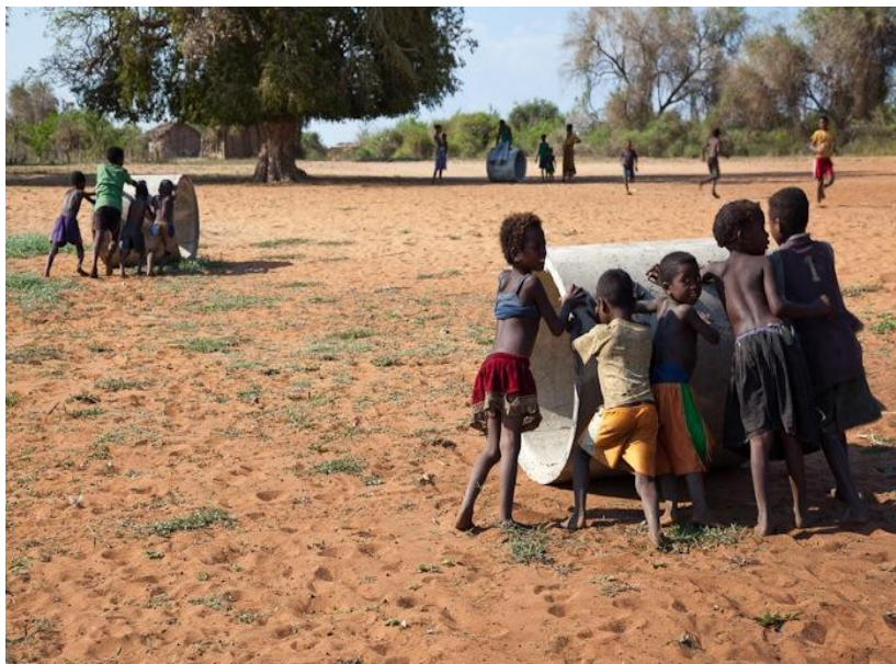
Ranobe kids come out, chirping and screeching, as they enthusiastically move cement liners for new wells in the village.