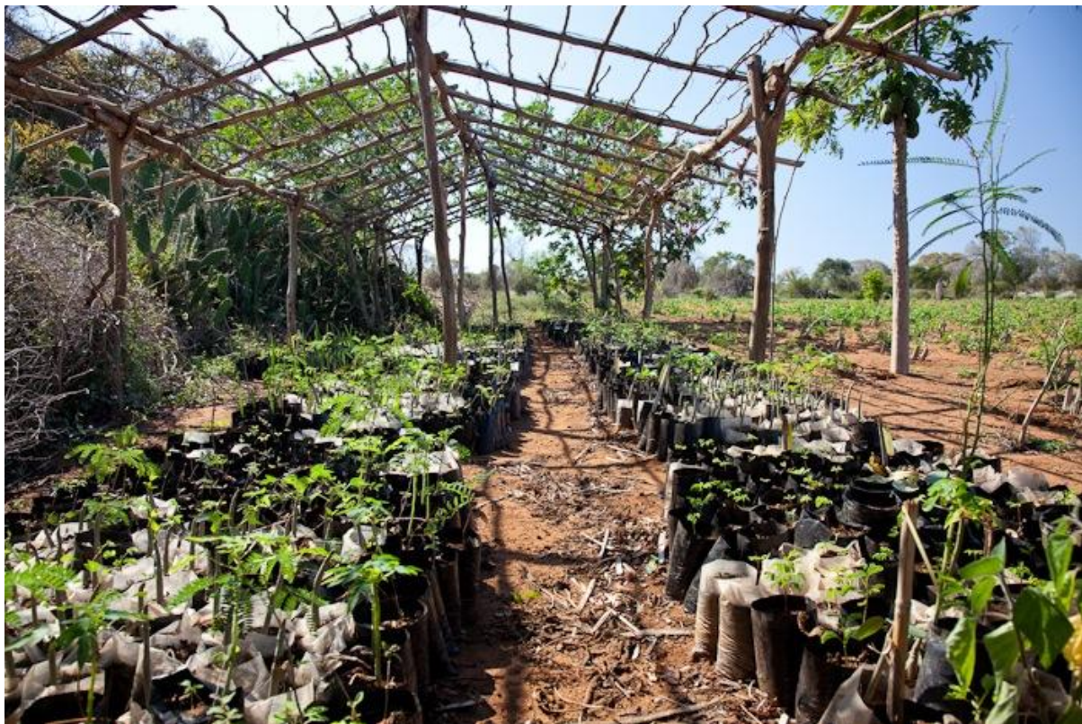
Nursery No.1, about 5000 trees are currently growing in this nursery and will be ready to be plated out around March 2012.

We have also built and stocked two new nurseries and I am pleased to report that we will have around 10,000 individual plants growing by the end of September. Right now is the best time to get as many seeds, of as many species in the ground because it is spring here, days are getting longer and we have the perfect conditions to grow almost anything here with enough water and attention. Villagers from distant and remote parts of the region have been showing up with all kinds of seeds from rare forest plants and we have been pleased to welcome this community seed collection process that was started by Martina Petru and continues to grow in a very grassroots fashion every year.