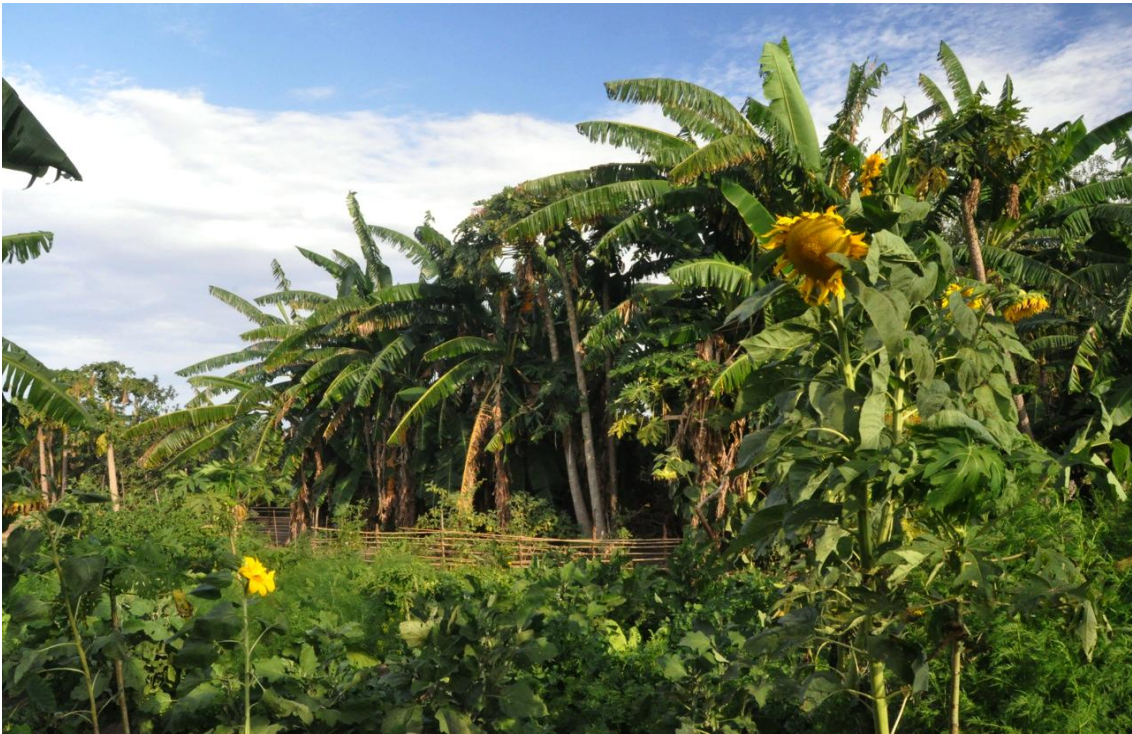
Marvelous banana sunflower garden, thriving lake side Ranobe.