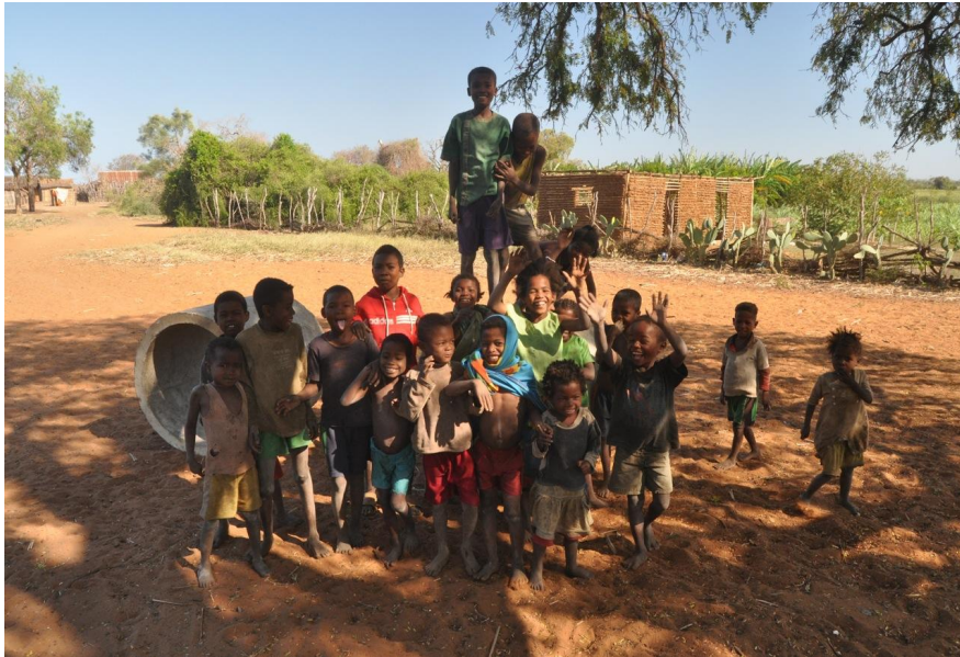
Ranobe kids excited about the community center progress (above). Tiber framed, mud walls and natural fiber roofing materials all sourced in Ranobe (below).

Since our last update in June we have got the main body of the center timber framed, walls mudded and foundation laid. We have the wood for the roof in the village now and this week we have the goal to get a roof on it. After the roof frame is complete the local guys will use reeds, and bamboo cut from the edge of the near by lake to make an excellent, natural fiber, waterproof roof. We will custom fit a frame on to the roof to house the SunPower donated solar panels that will power the center and are on their way to Toliara very soon!