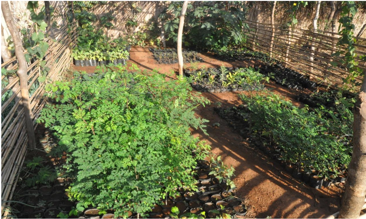
Nursery No.2, has around 2000 plants of fast growing species and 500 individuals have already been transplanted out of the nursery and into the ground in just three months!