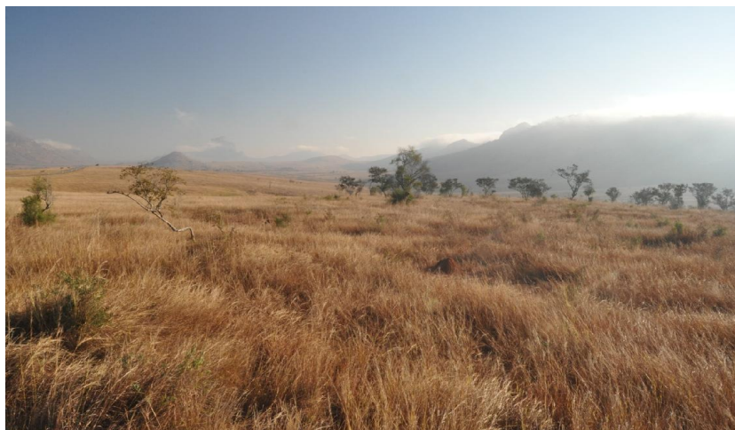
Deforested landscape around Isalo National Park.

Around Isalo the forest has been truly cleared and fuel (wood) for cooking is in major shortage. Thus when the owners of the lodge found out the biogas digester can produce around six hours of cooking fuel everyday and is a combination of dry and wet digestion technologies they welcomed this truly unique design and pioneering group.