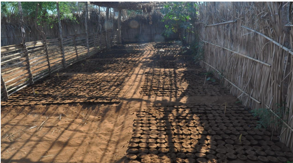
Nursery No.3, newly stocked, with a combination of fruit, fast growing and native species has 4000+ pots.