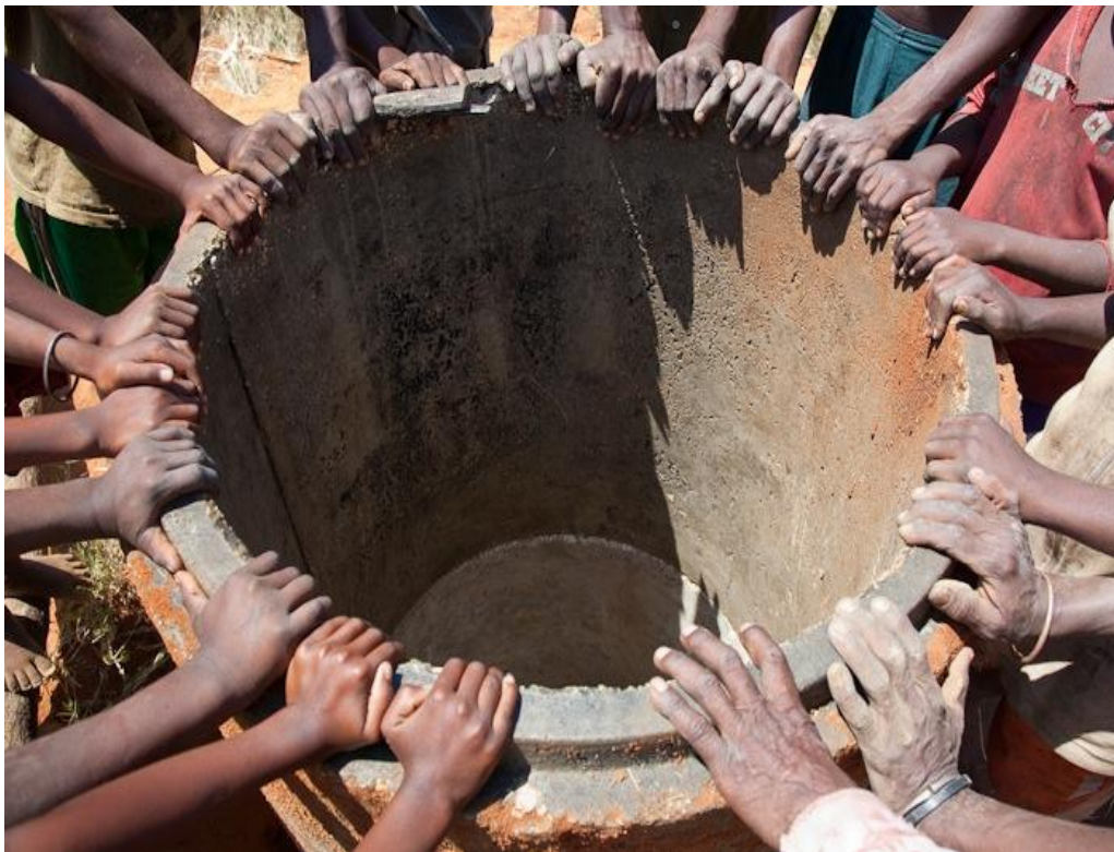
Balzac leading the implementation and completion of seven new wells in Ranobe village.