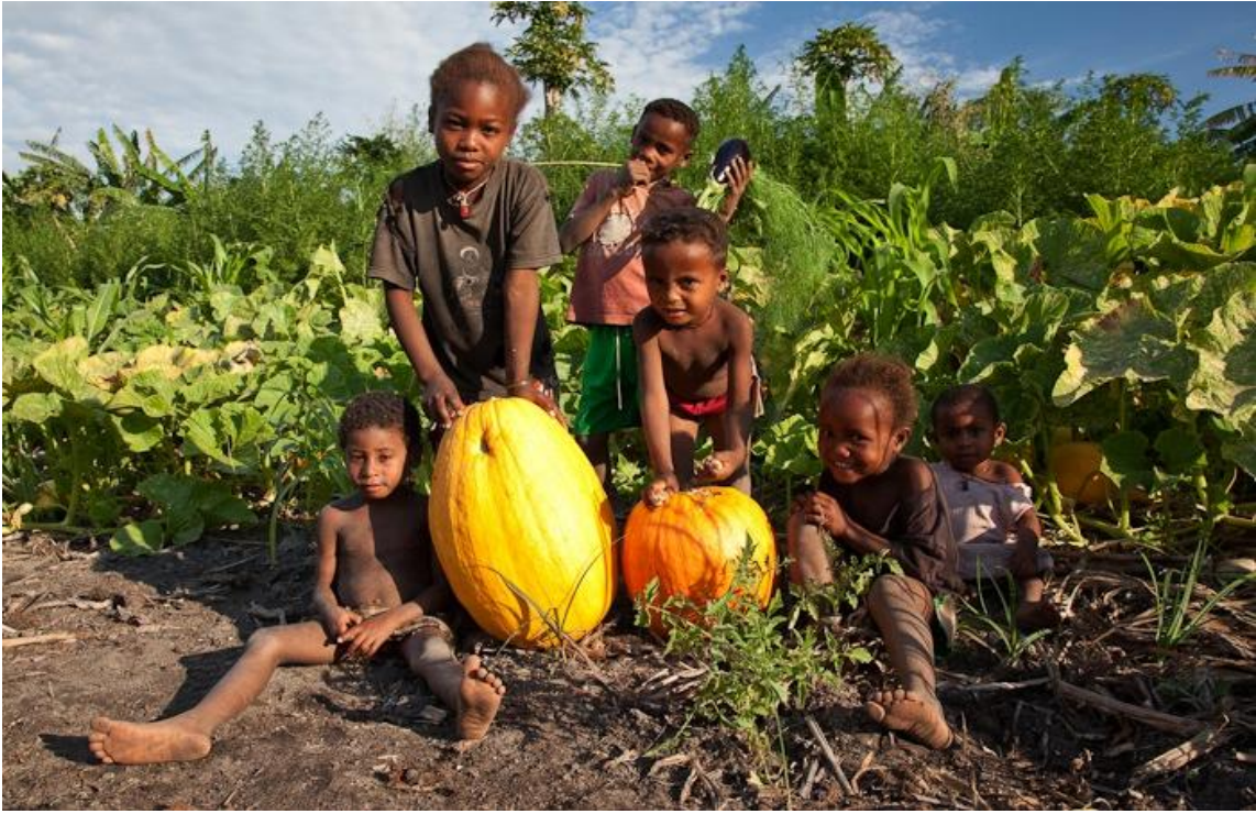
Pumpkin variety brought from Michigan, planted in Ranobe are gigantic in this ideal growing environment and are a new variety of food being spread around the village.