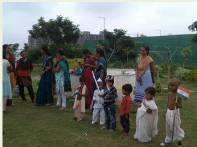
Rakshabandhan Festival Celebration!!