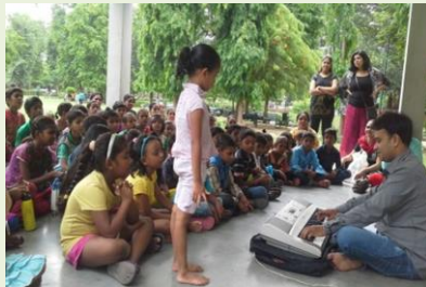
Independence Day Celebration!!